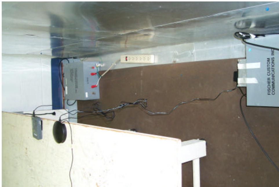
Figure 3.5 Conducted Rear