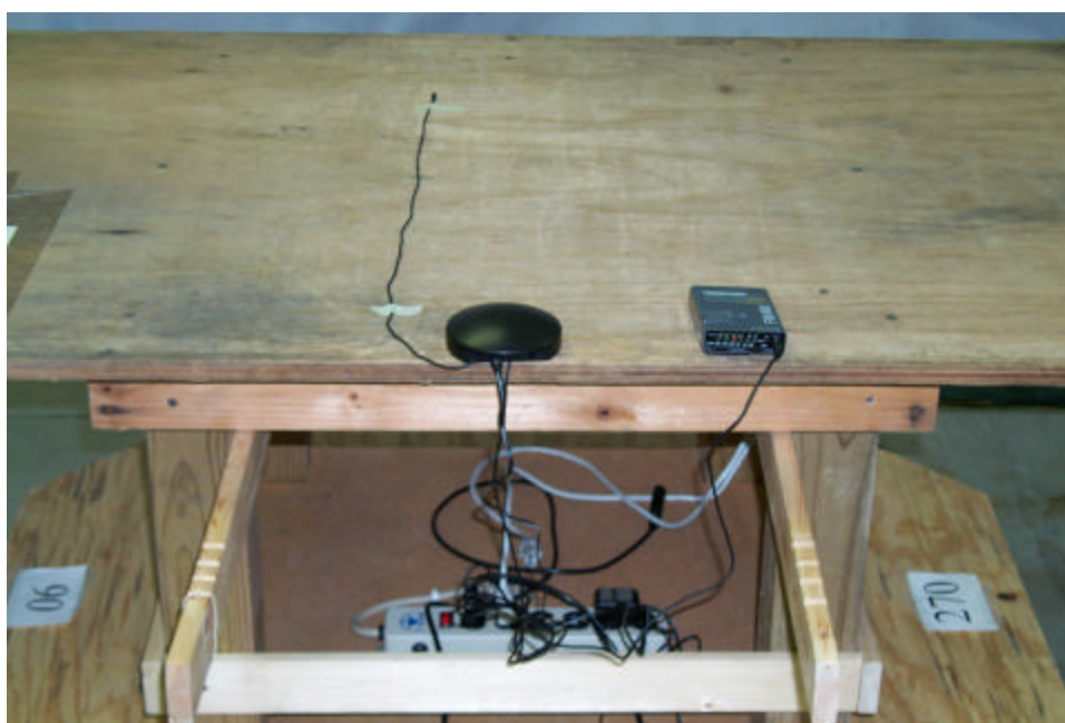
Figure 3.3 Radiated Rear