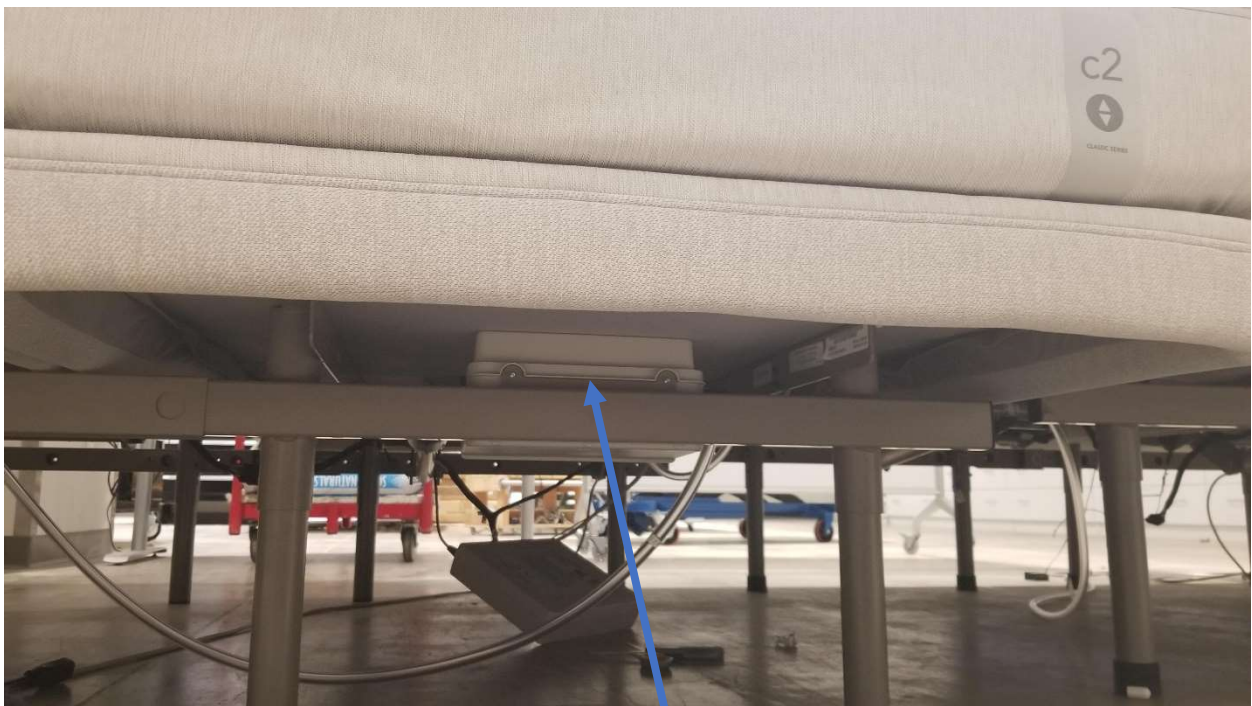
360 Pump Mounting location (LPM-7000C)