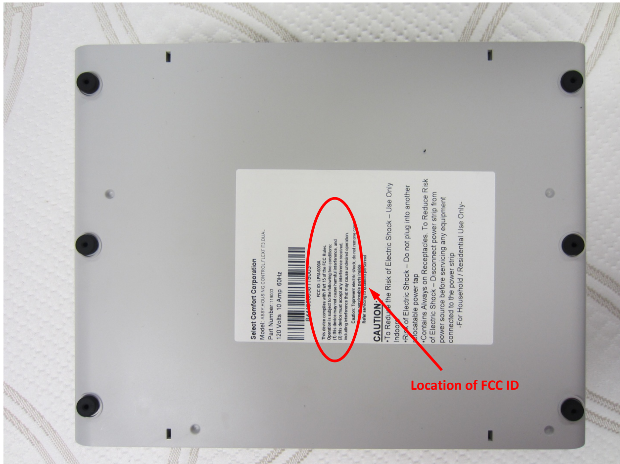
Figure 1 - Assembled Flex Fit Controller looking from bottom showing location where FCC ID will be embedded in the label