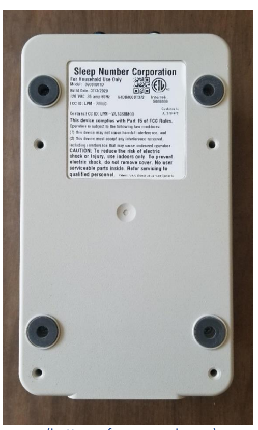
(bottom of pump enclosure)