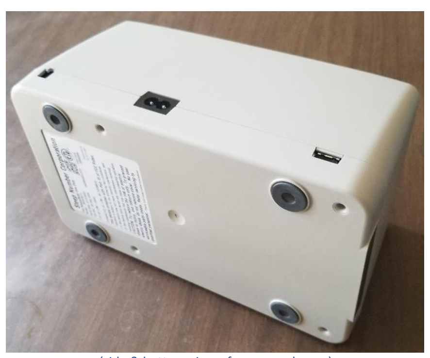
(side & bottom view of pump enclosure)