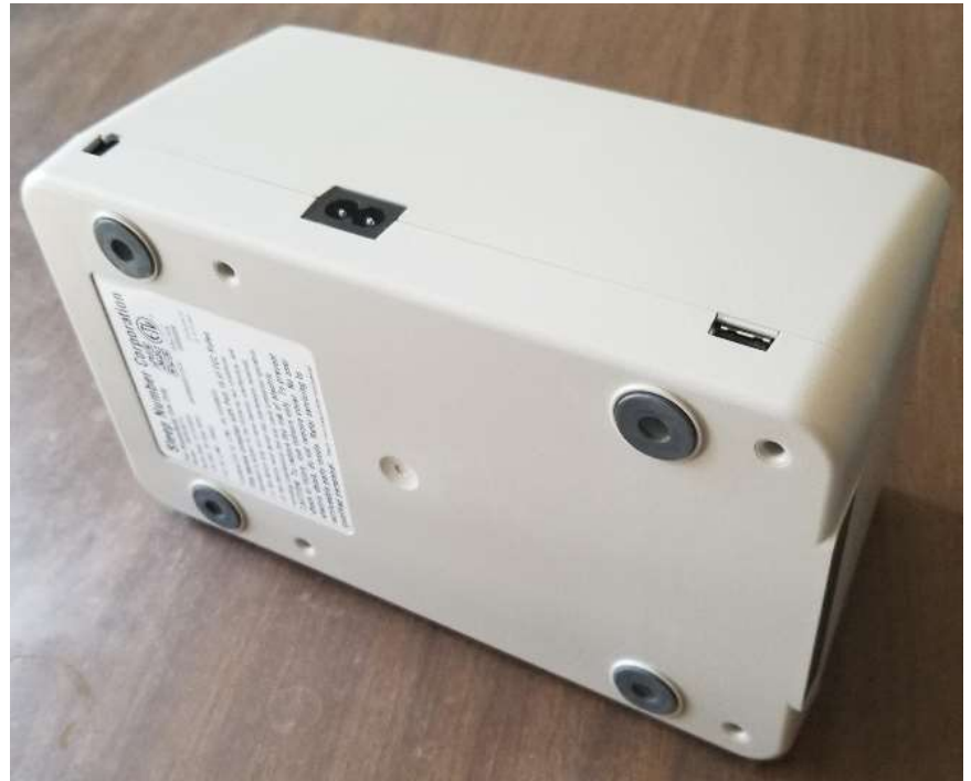
(side & bottom view of pump enclosure)