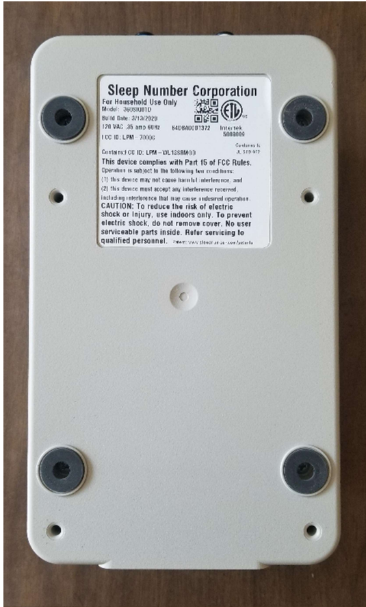
(bottom of pump enclosure)