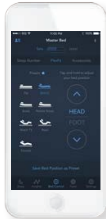
Adjust and save your favorite bed positions.