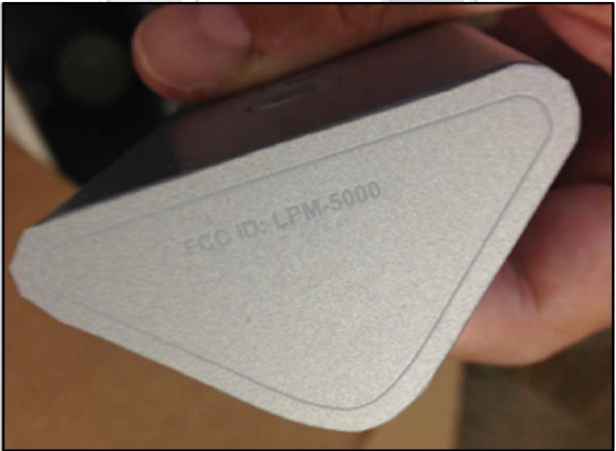
Physical Location of FCC Label on EUT