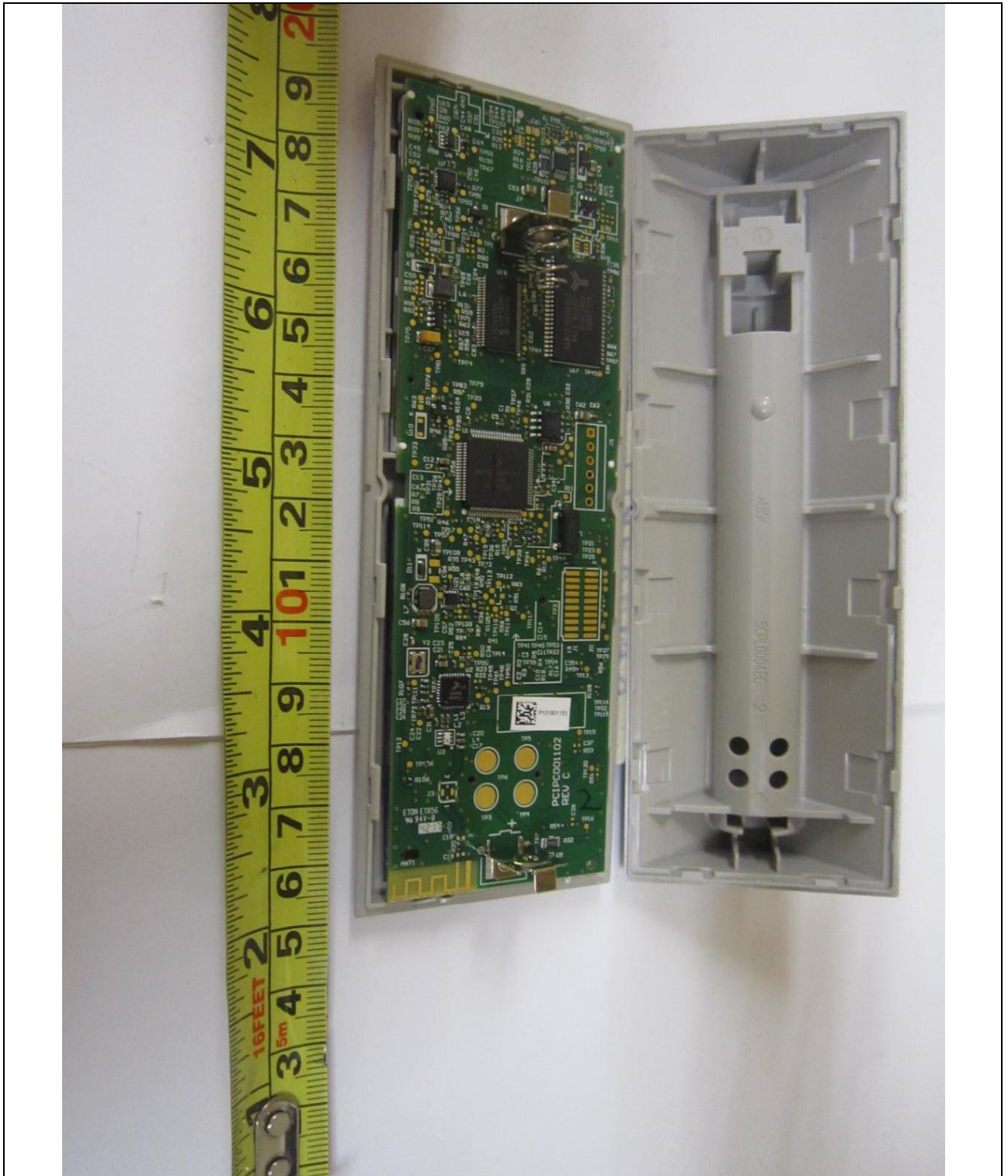
EUT Internal View 1