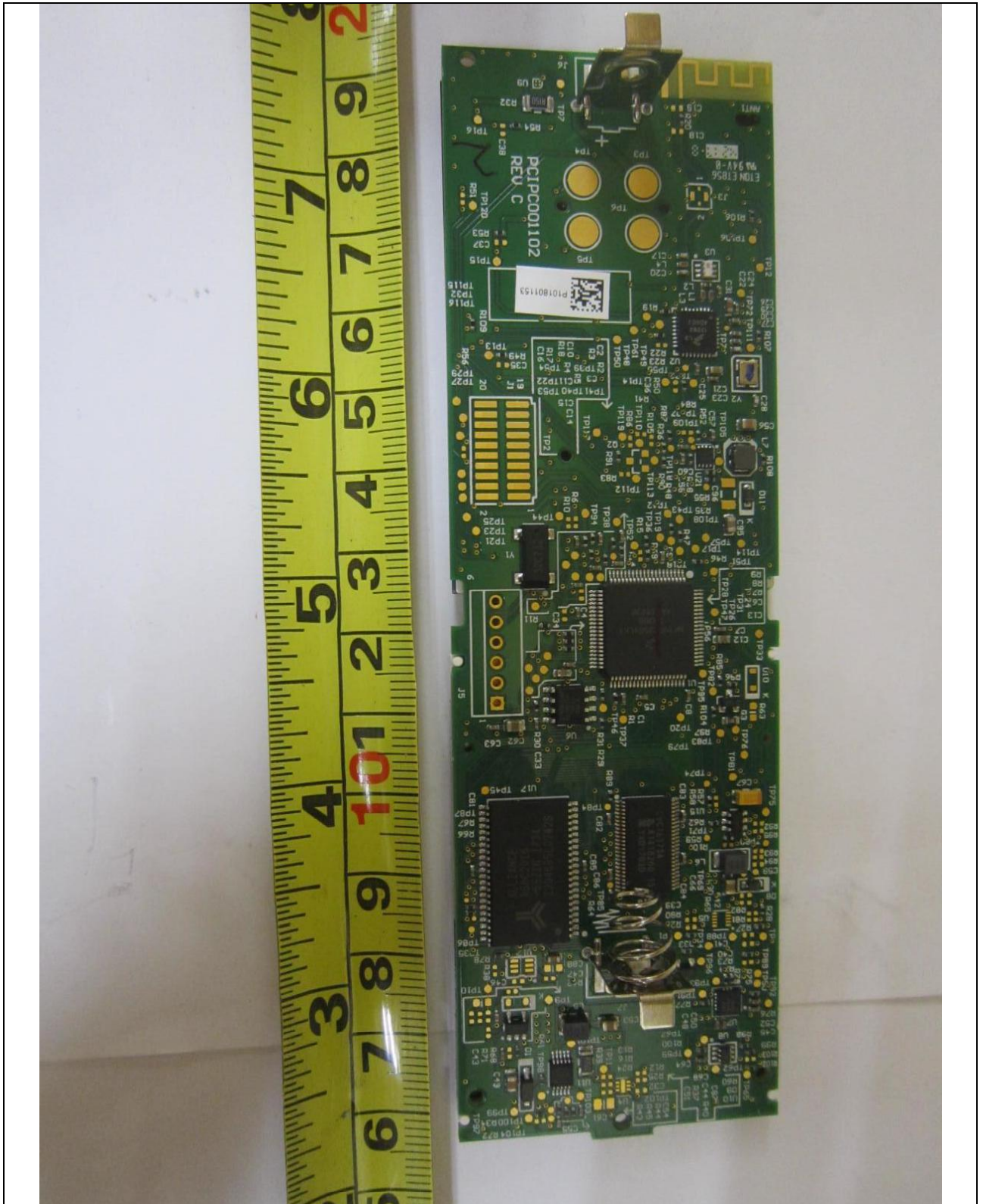
Main-Board PCB Trace Side