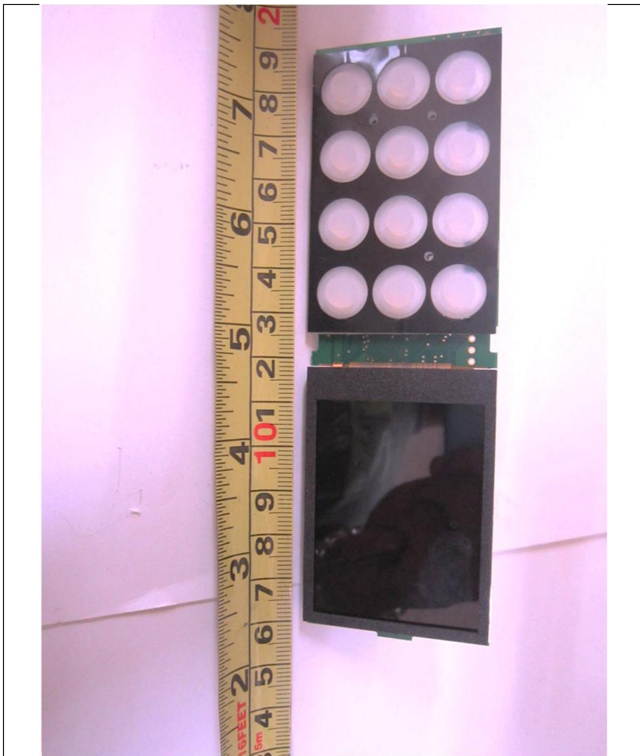
Main-Board PCB Component Side