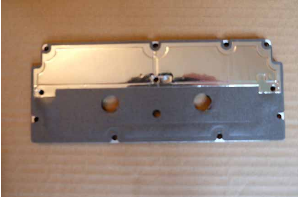
Foil was added on the EMI gasket