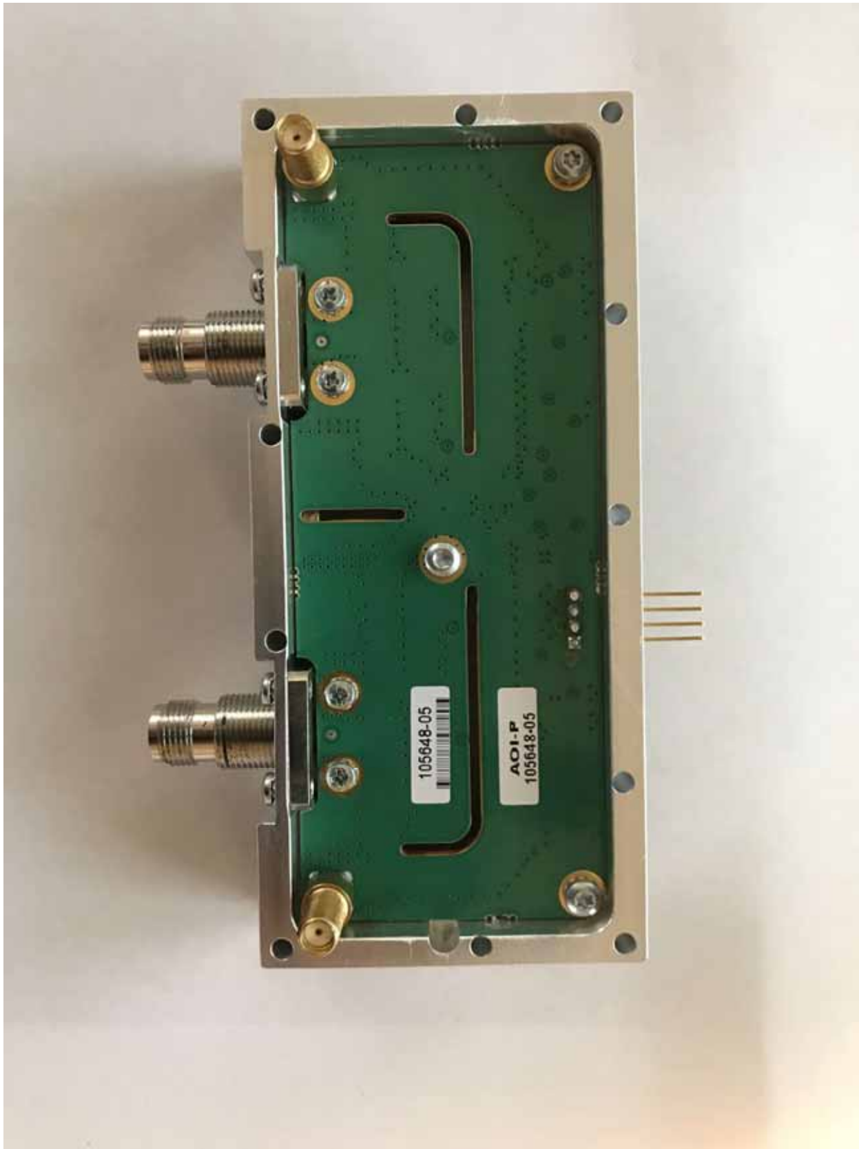
New TNC connectors.