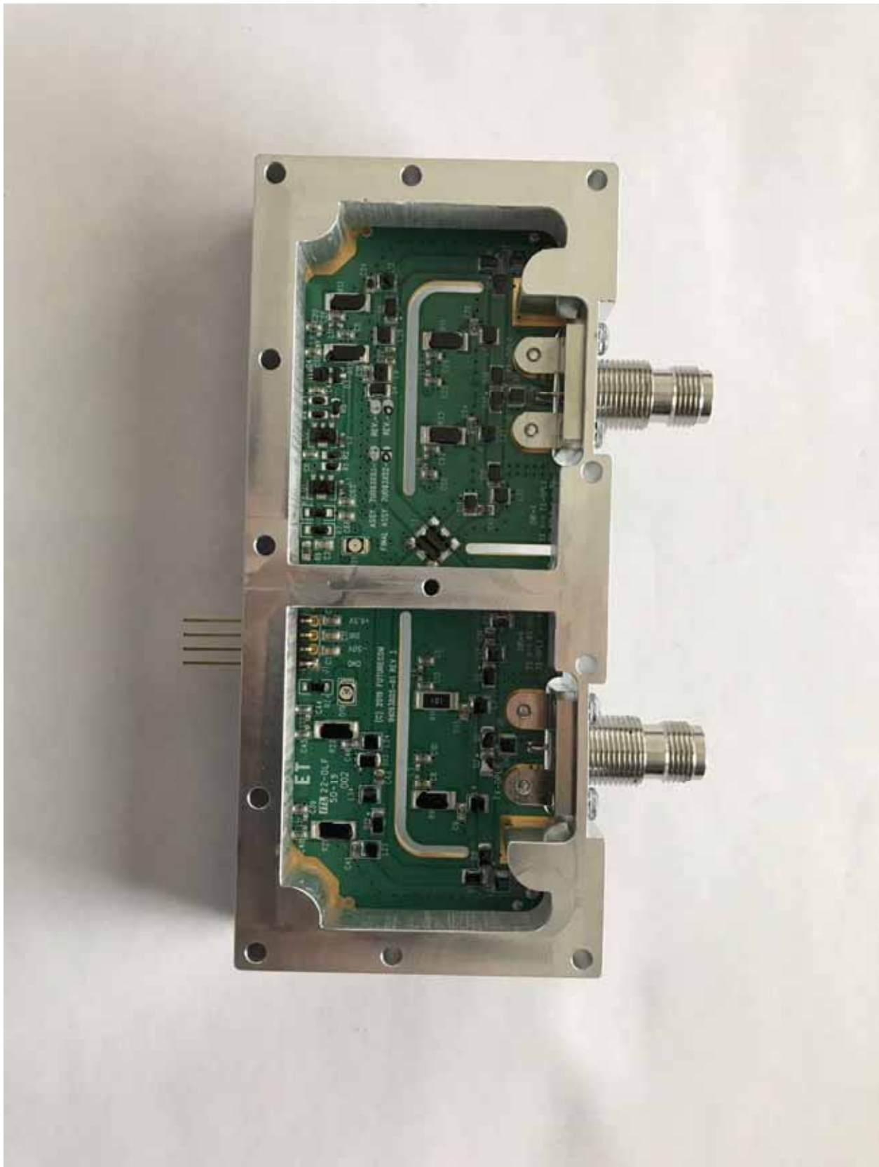
New TNC connectors.