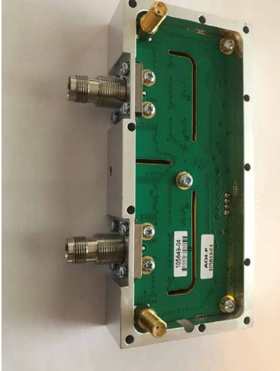
New TNC connectors.