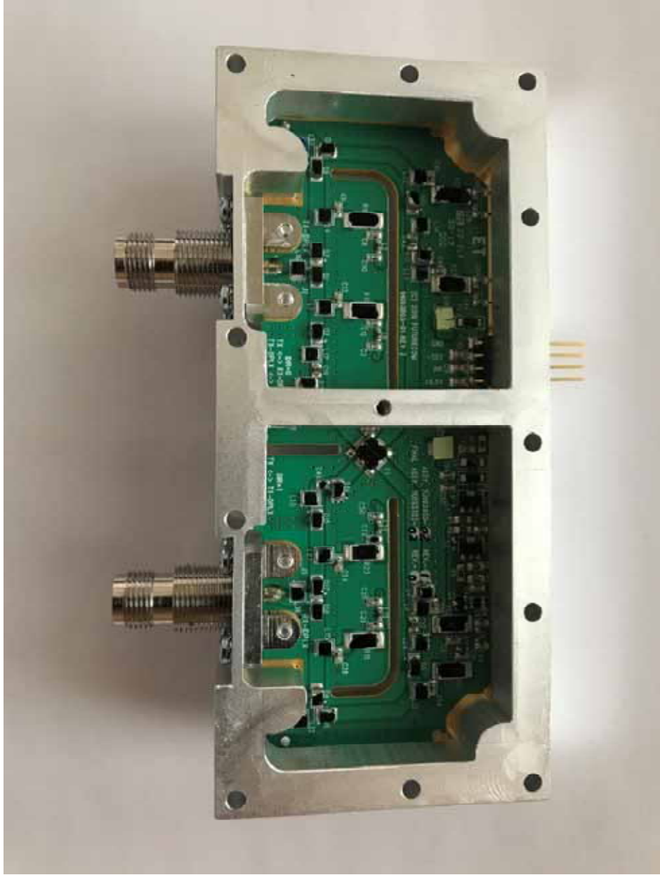
New TNC connectors.