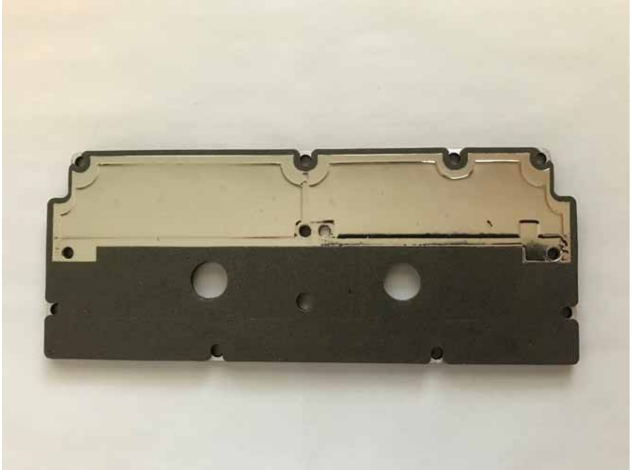
Foil was added on the EMI gasket