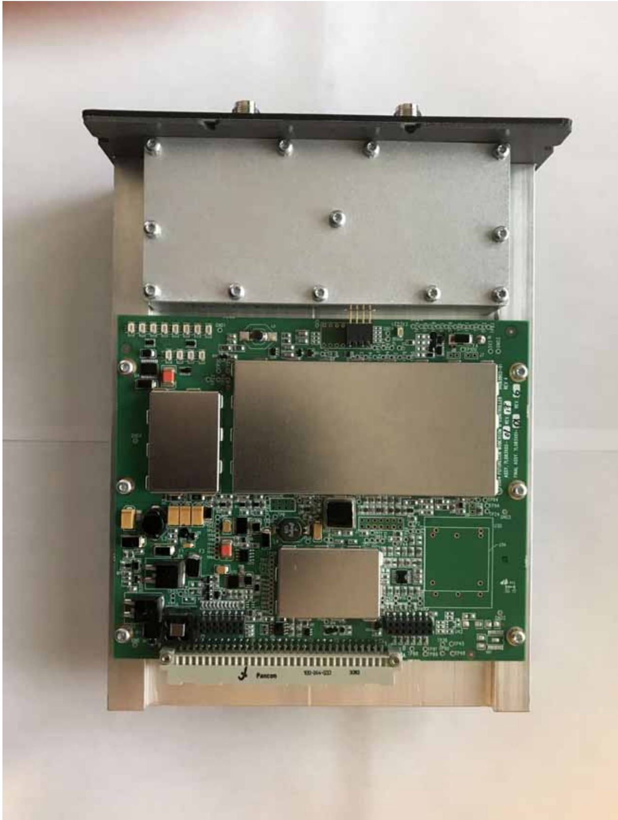
Finger stock was added on both long partition edges.