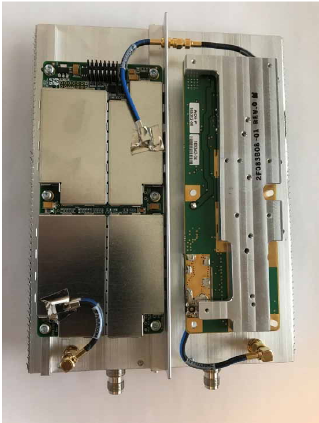
Finger stock was added on both long partition edges.