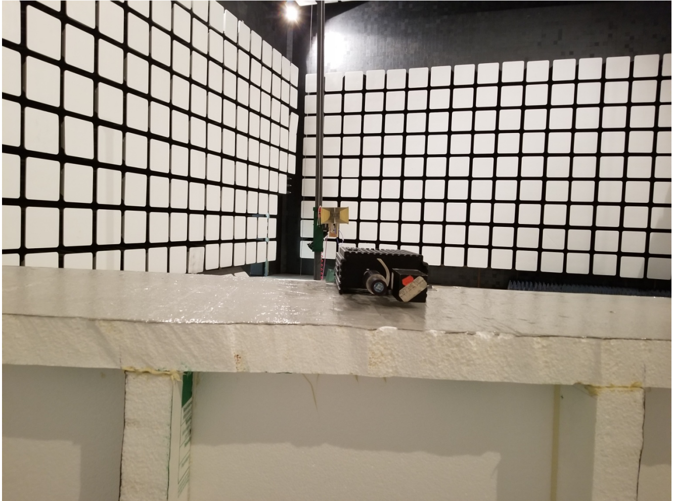
Radiated Emissions at 3 m, Above 1 GHz