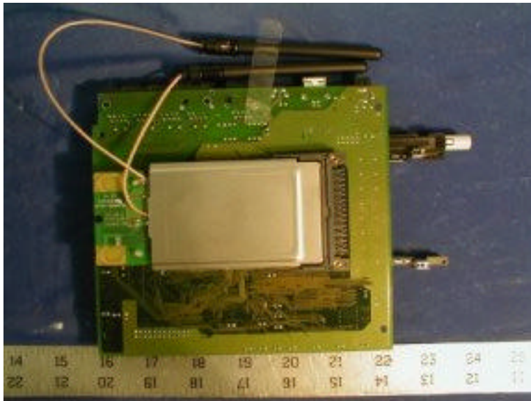
EUT – Transmitter View