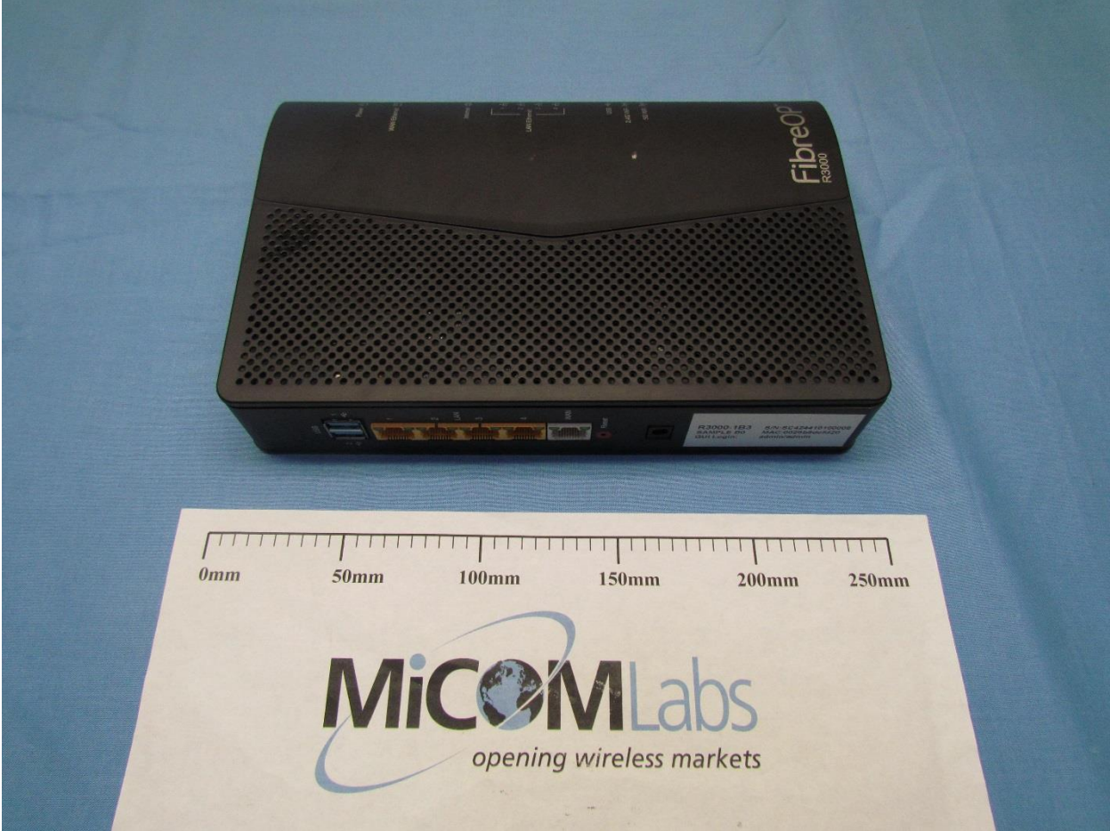
EUT port side 1