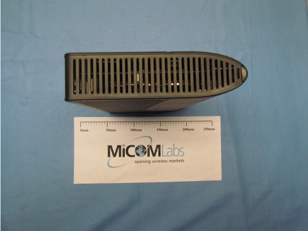
EUT side 3