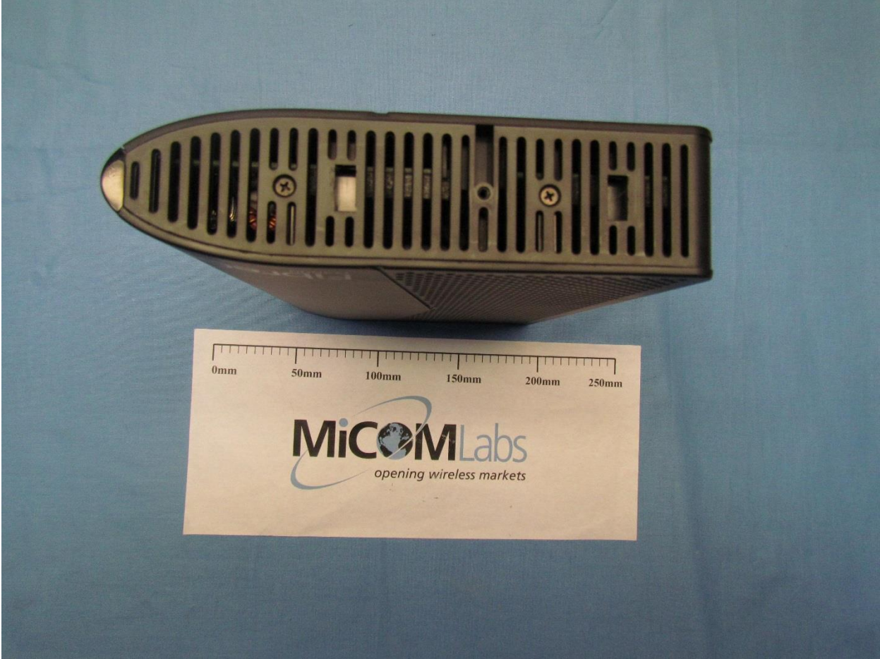
EUT side 2