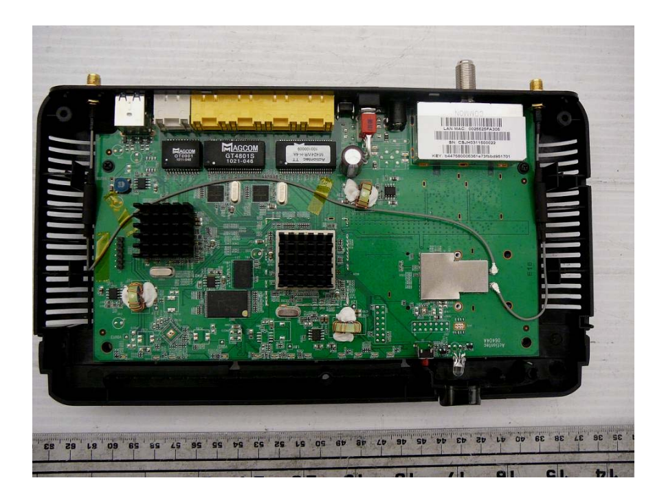
15.8 Main Board Top View (with Shielding)