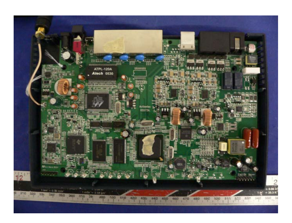
EUT – Component View