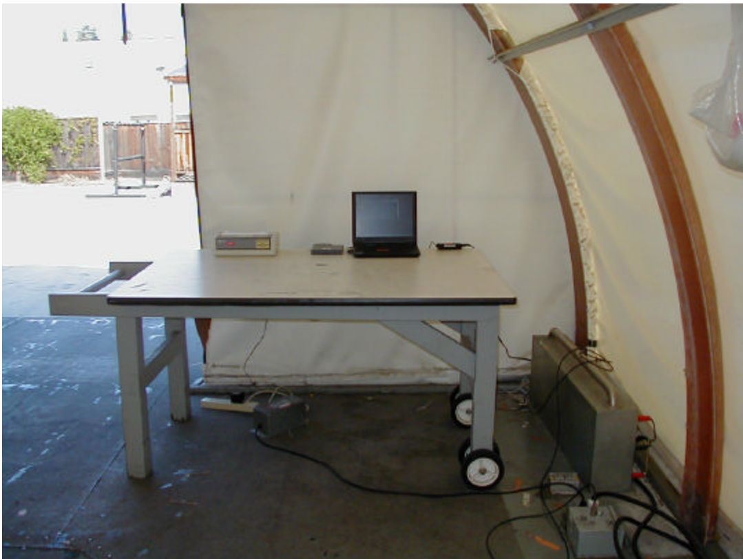
AC Conducted Emissions