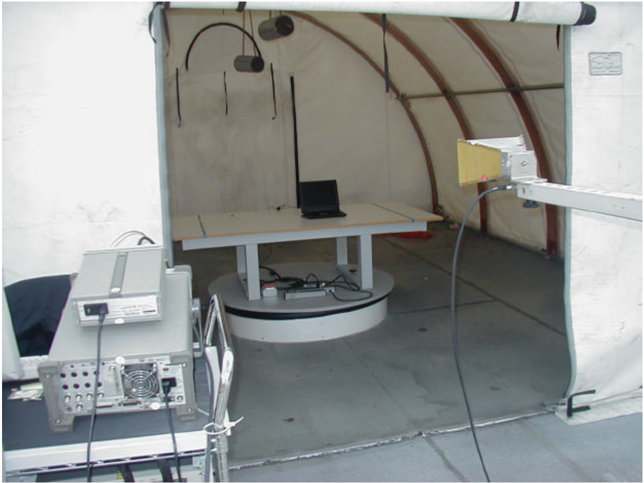
Radiated Emissions Above 1GHz (Radio Spurious Emissions)