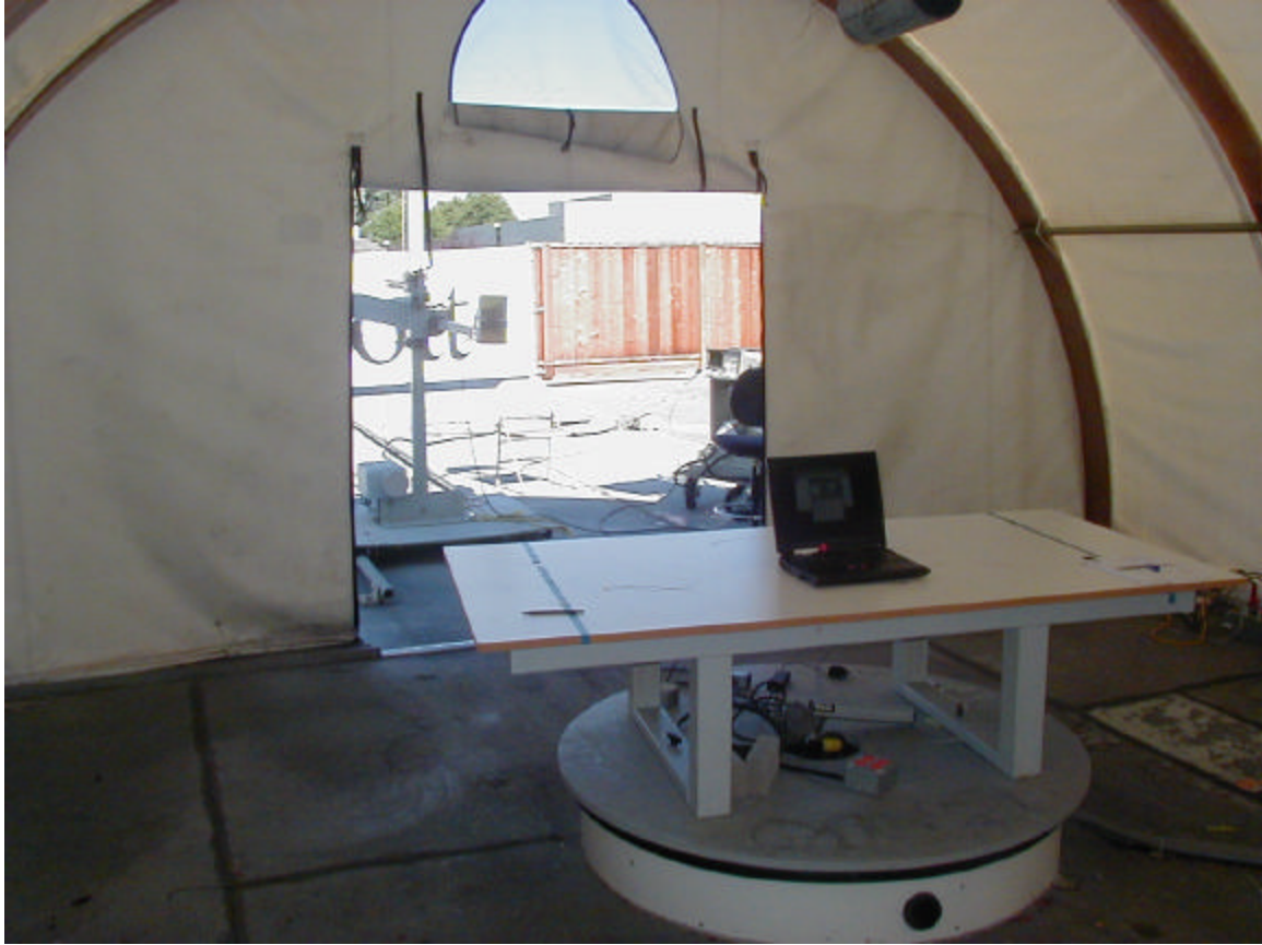
Radiated Emissions 1 of 2