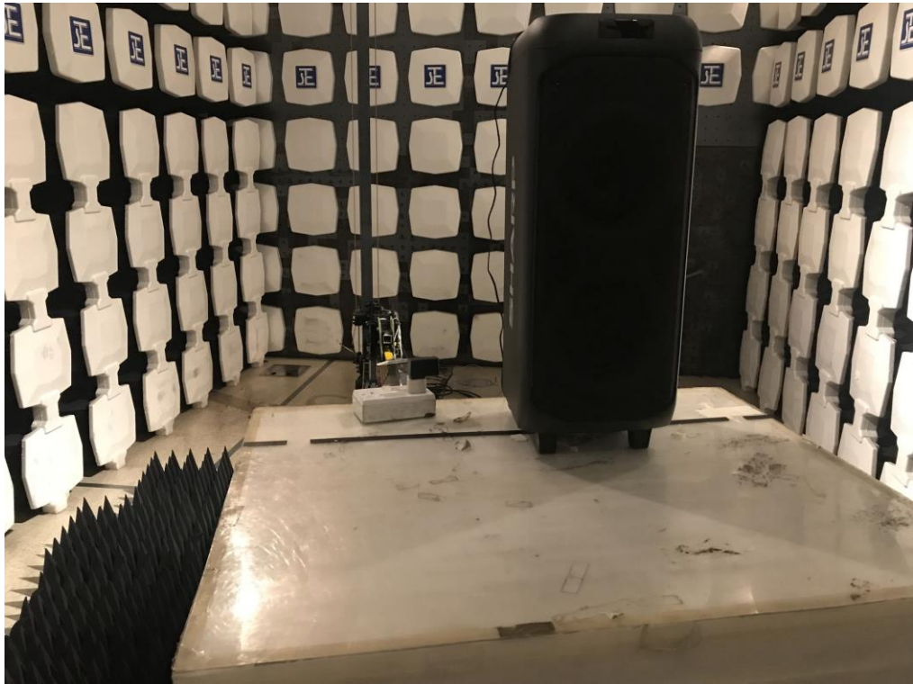
Measurement of Conducted Emission Test Set Up