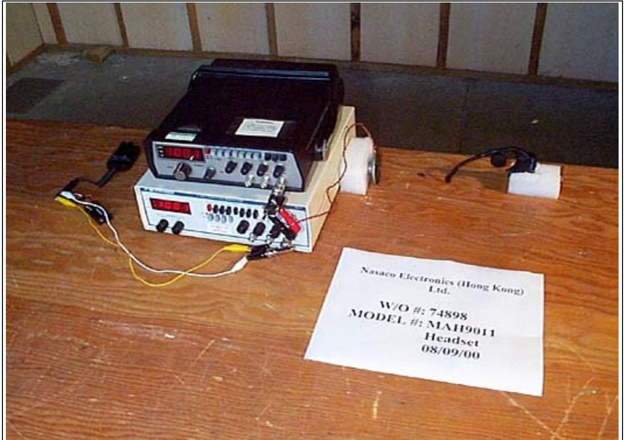
Transceiver Radiated Emissions - Front View, Side Orientation