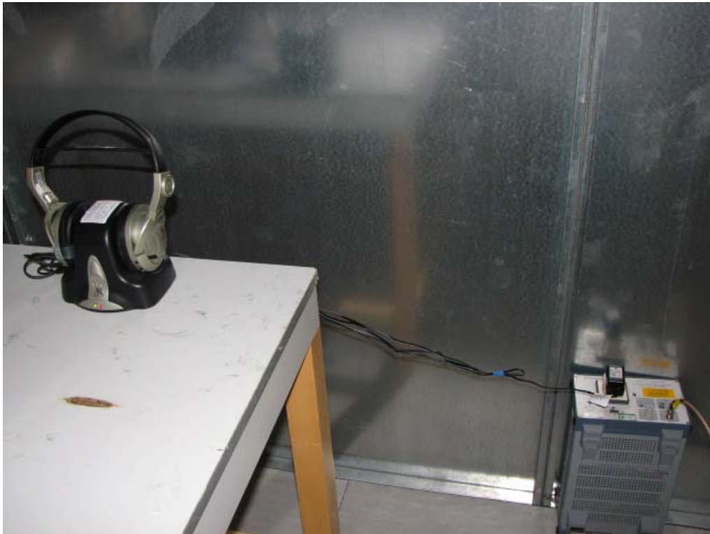
Set-up for Conducted Emission