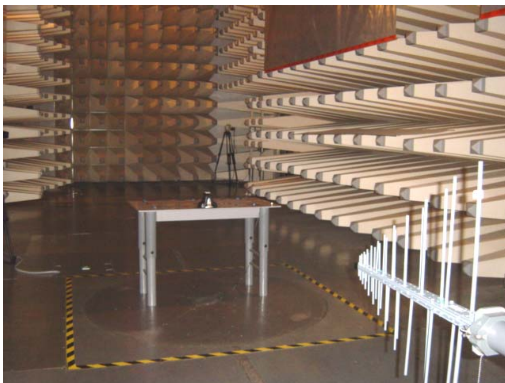
Set-up for Radiation Emission (Transmitter)