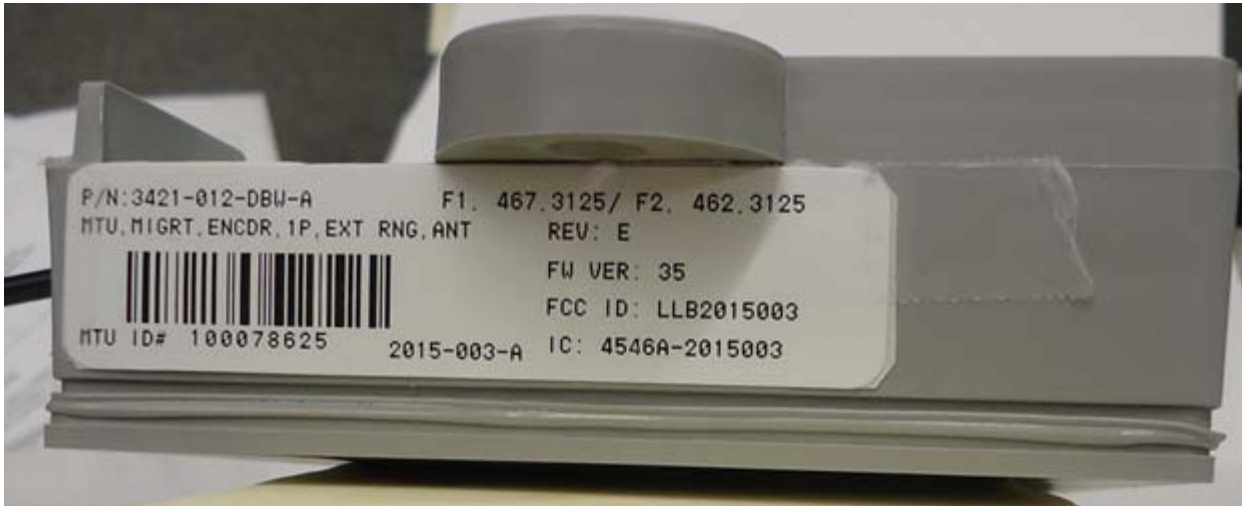
Photo showing location of the label.

Photographs, one showing placement of Label