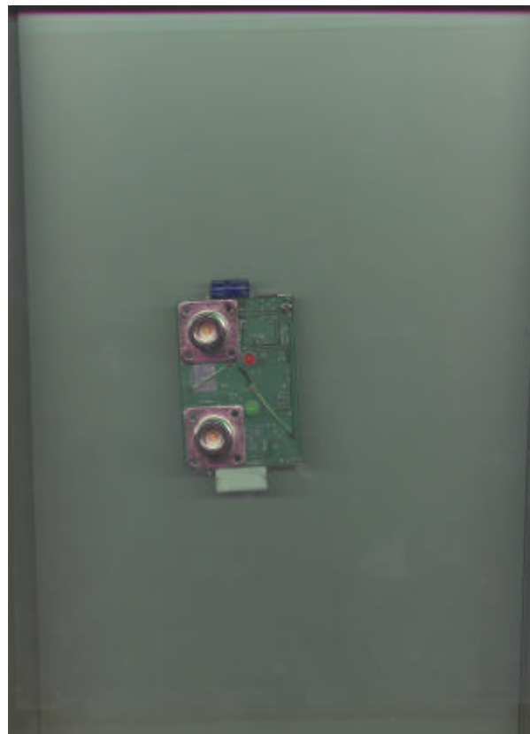
250mW Solder Side