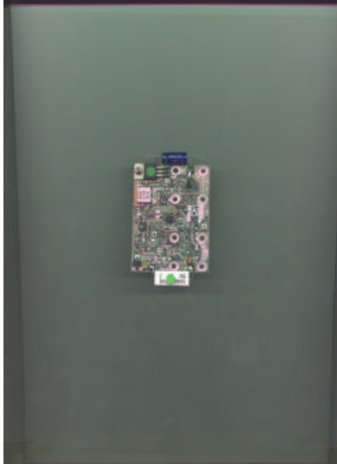
250 mW COMPONENT SIDE