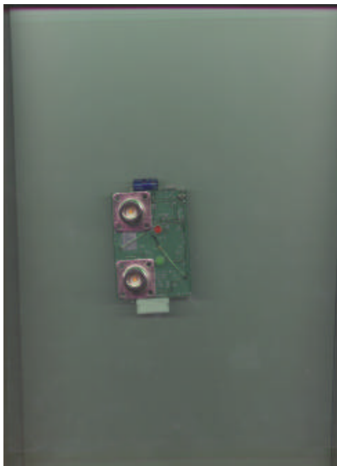
250 mW SOLDER SIDE