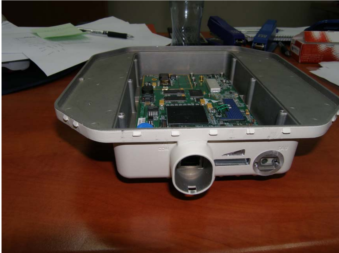
Photo2 ODU Connector side view