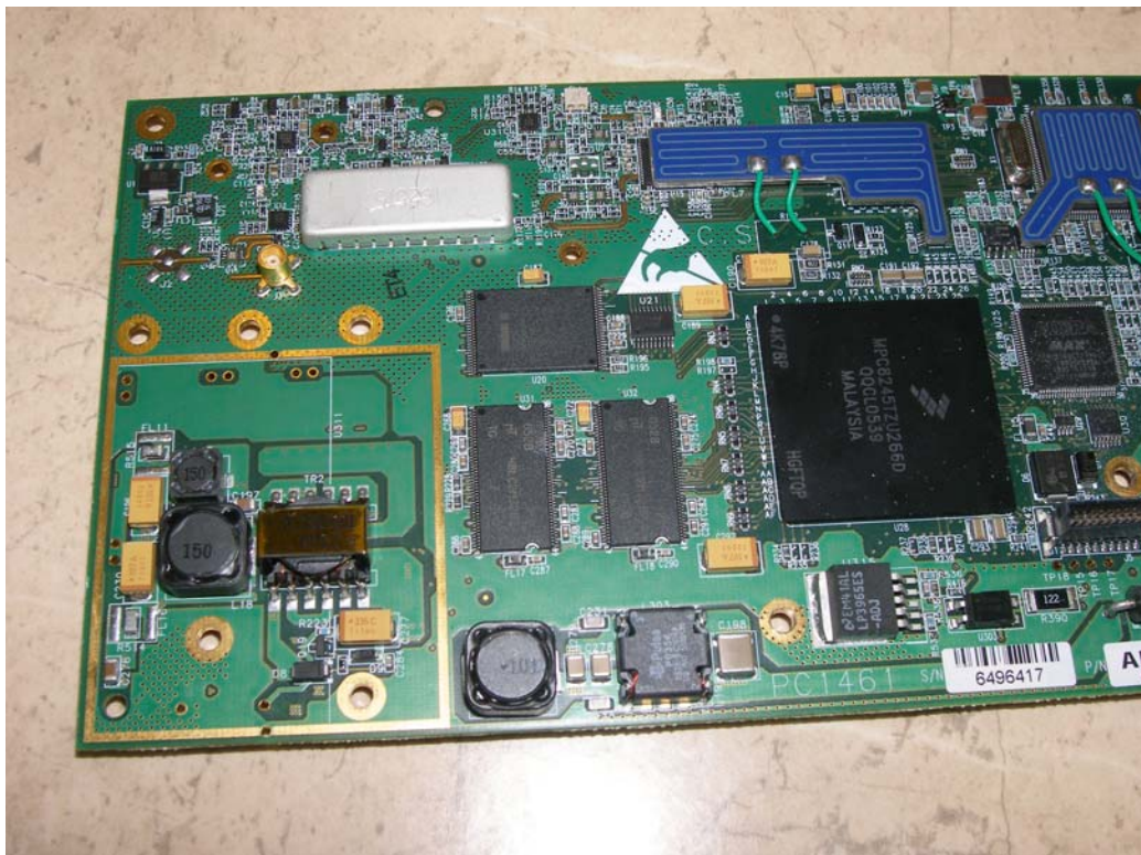
Photo8. PCB component side