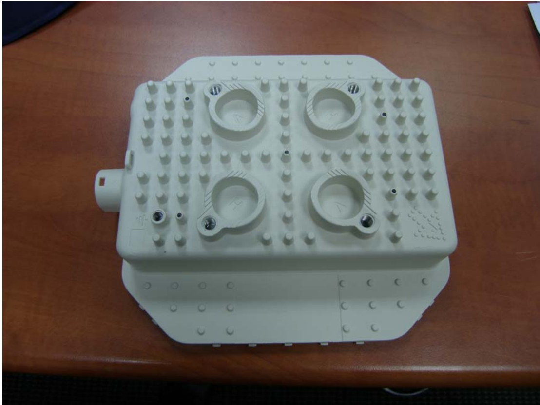
Photo3. ODU Rear case