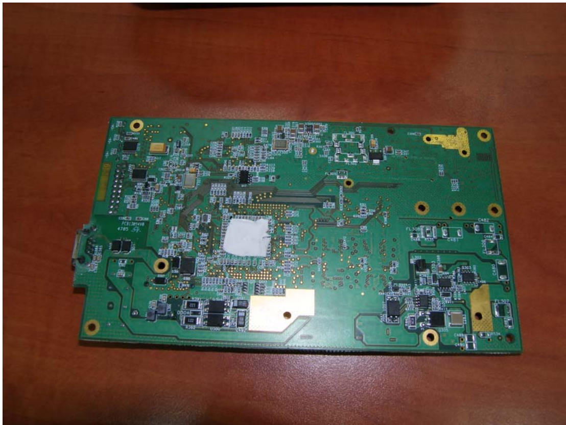
Photo4. PCB print side