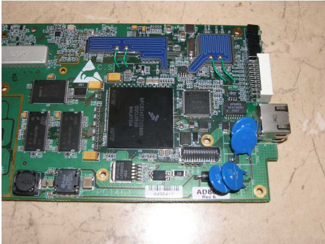
Photo7. PCB components side