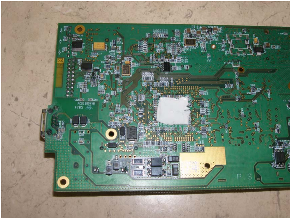
Photo6. Print side