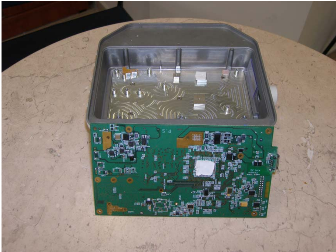
Photo9. Housing view with PCB