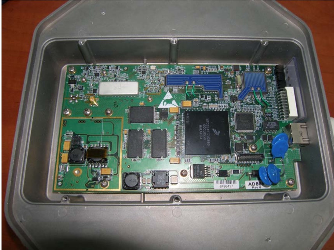
Photo 1. ODU open cover

BreezeACCESS VL 5.8 and Point to Point BreezeNETB system FCC ID: LKT-VL-IF