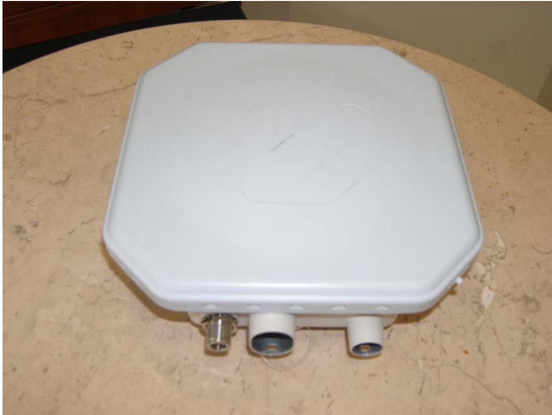
Photo11. ODU cover side view