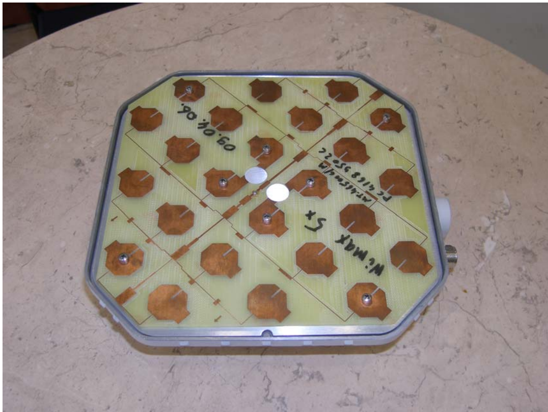
Photo10. Integrated antenna