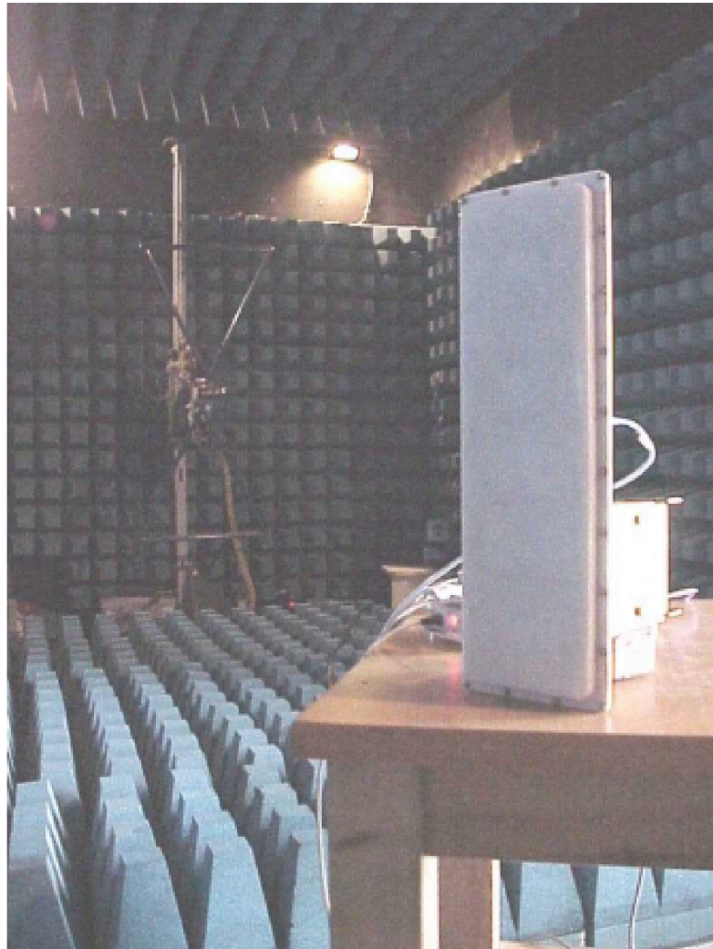
Photo #6. Radio unit with MTI sector antenna P/N MT-484025/NV. Spurious emission test