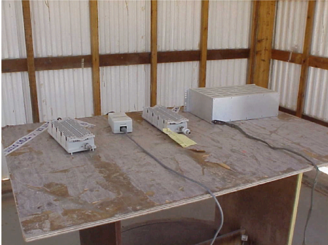
Photo #4. Base Station + Subscriber Unit Radiated emission test on open site