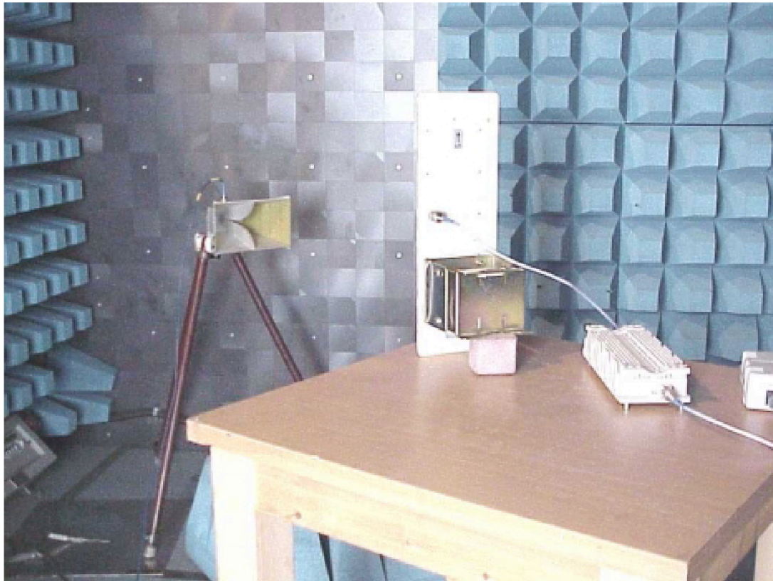
Photo #5 Radio unit with MTI sector antenna P/N MT-484025/NV. Spurious emission test