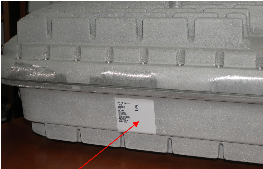
Label with FCC ID:LKT-MICRO-25 location