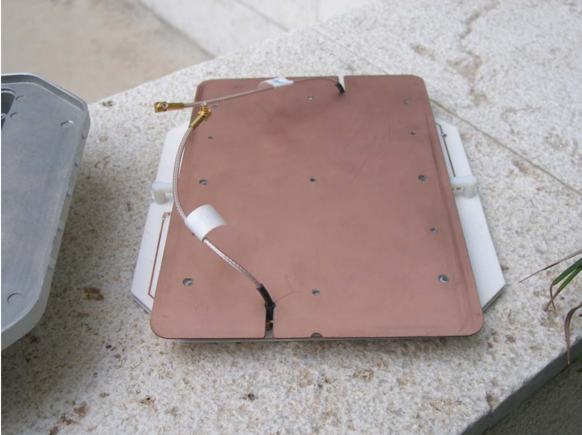
Photo4. antenna rear view