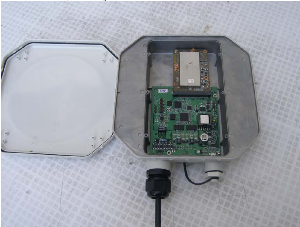
Photo5. Internal view, digital board and RF board