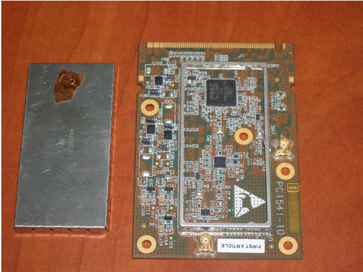
Photo7. Radio module with RF cover removed