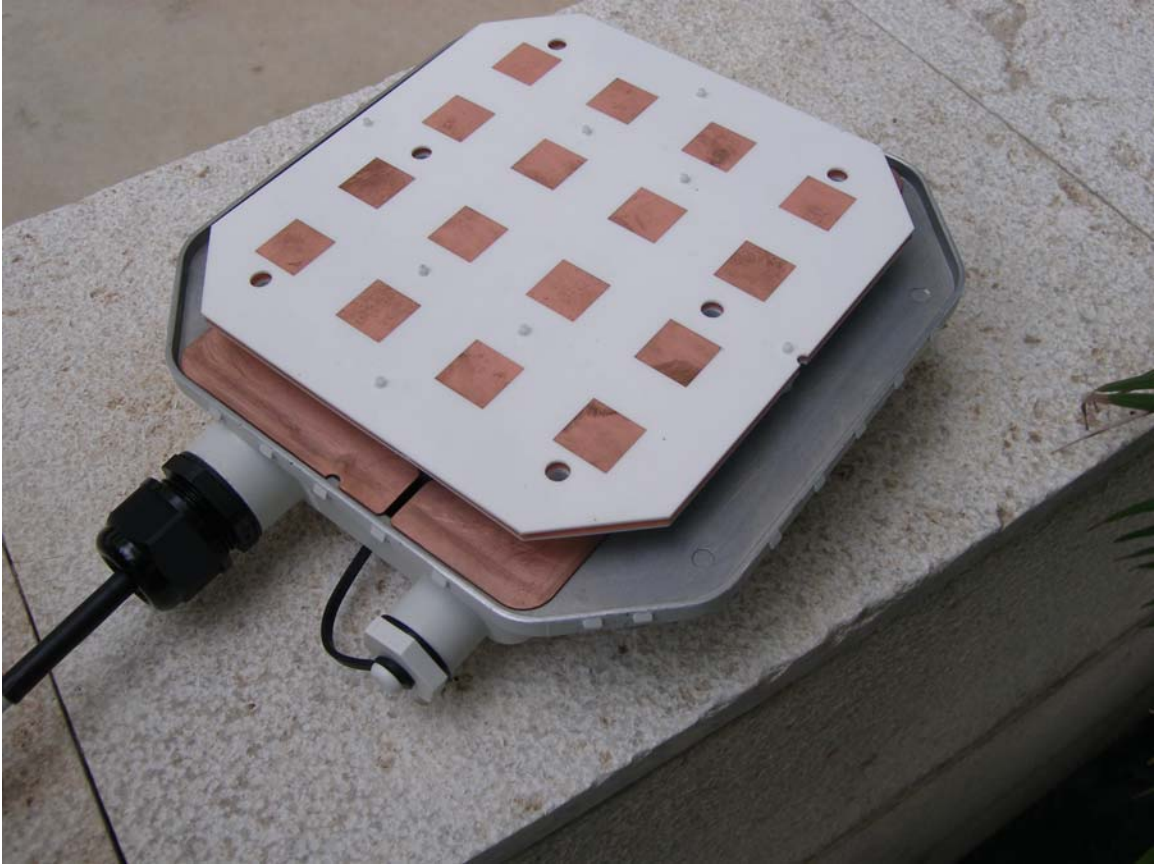
Photo3. integral antenna view