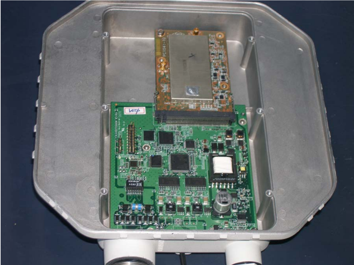
Photo6. Internal view , close up