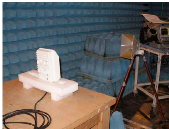
Photo #2. Radiated emissions test setup. Investigation test at 1m test distance.