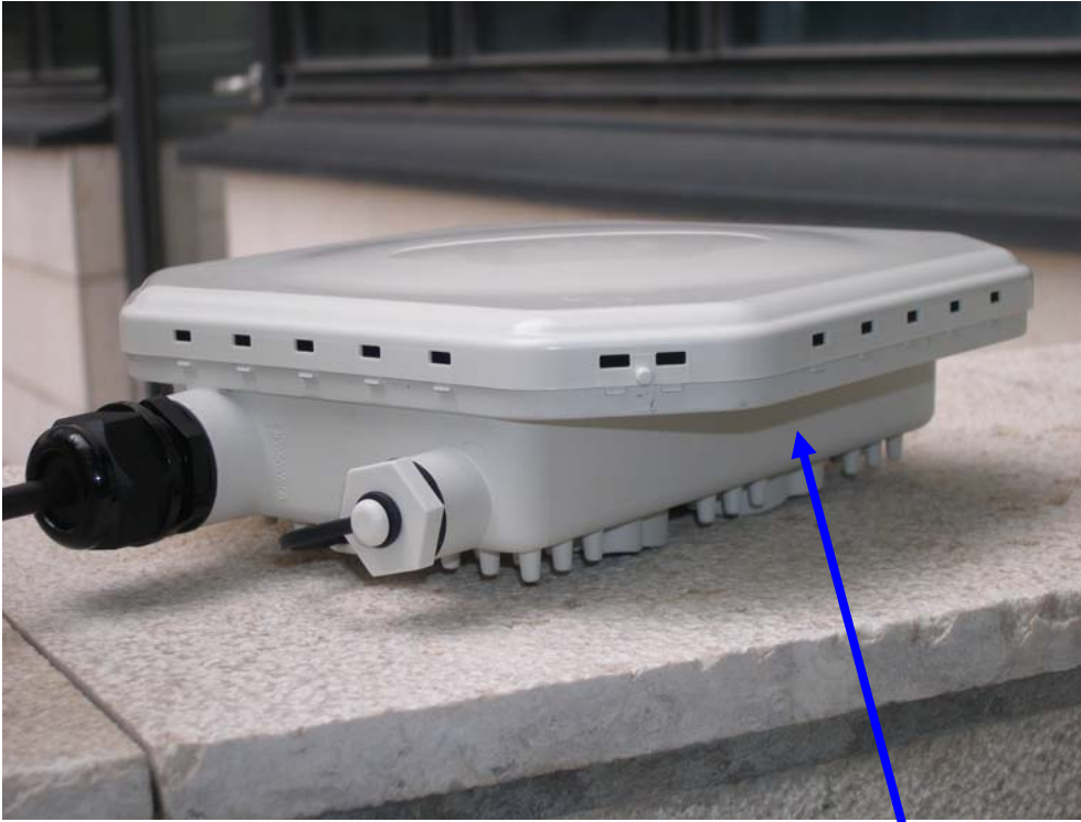
Photo1. External view

Name: BMAX-EXTR-CPE-DIV-1D-4.9-2-A FCC ID: LKT-EXTR-CPE-50