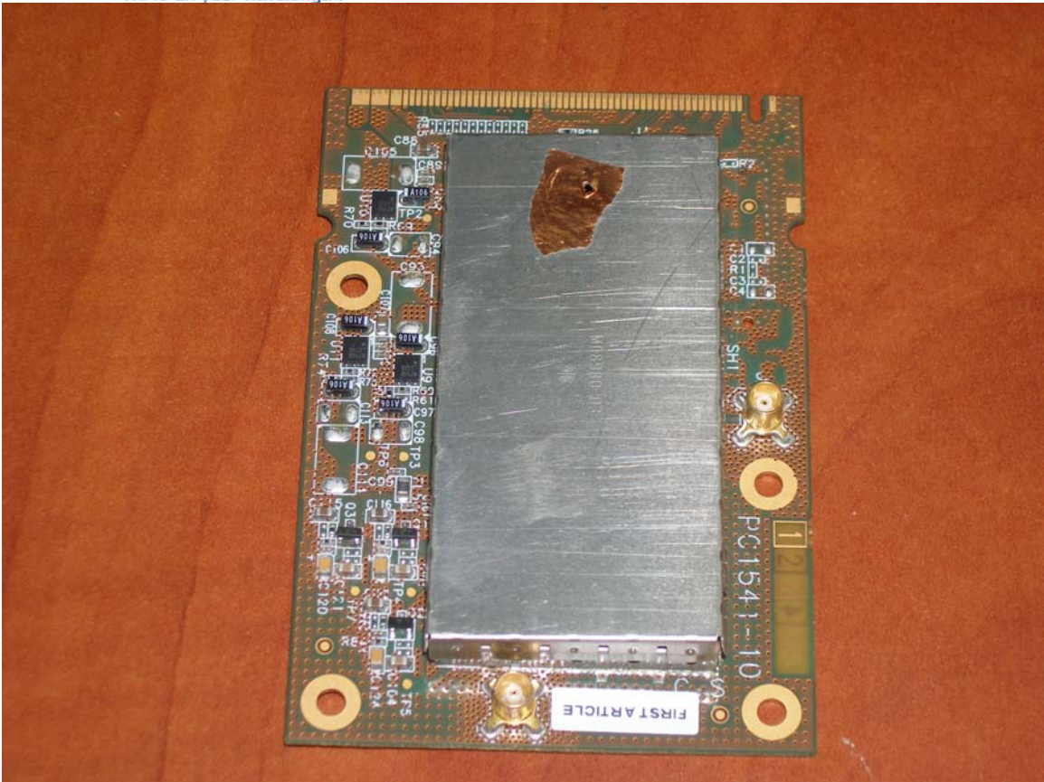
Photo9. Radio module CS view with RF cover