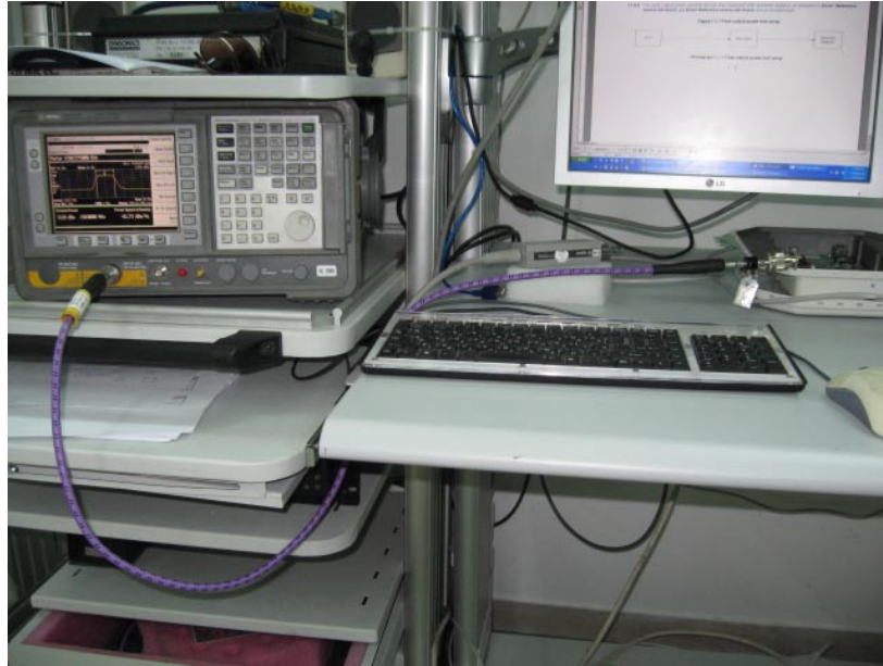
Photograph No.1 Peak output power, occupied bandwidth, emission mask measurement setup