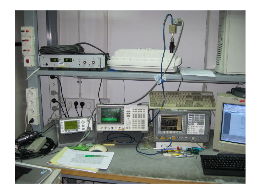
Photograph No.1 Peak output power, occupied bandwidth, emission mask measurement setup