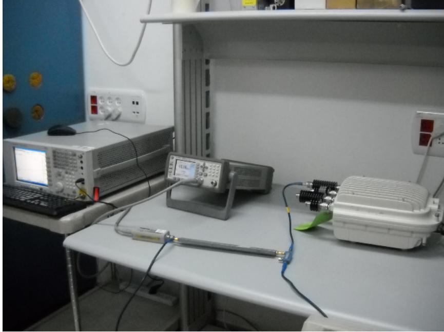
Photograph No.1 Peak output power measurement setup