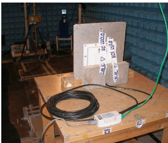
Photo 3. Radiated emissions test setup with internal antenna.