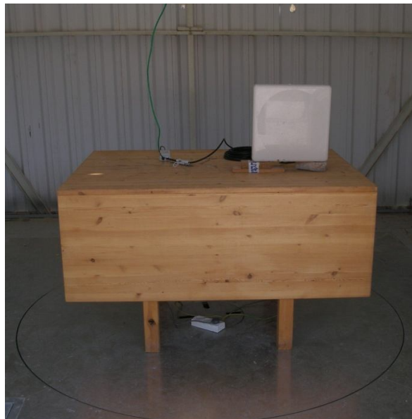
Photo 2. Radiated emissions test setup on OATS.