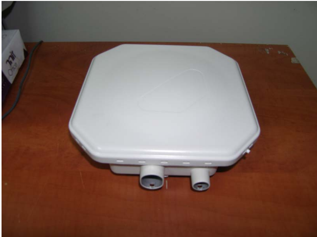
Photo1. CPE top view