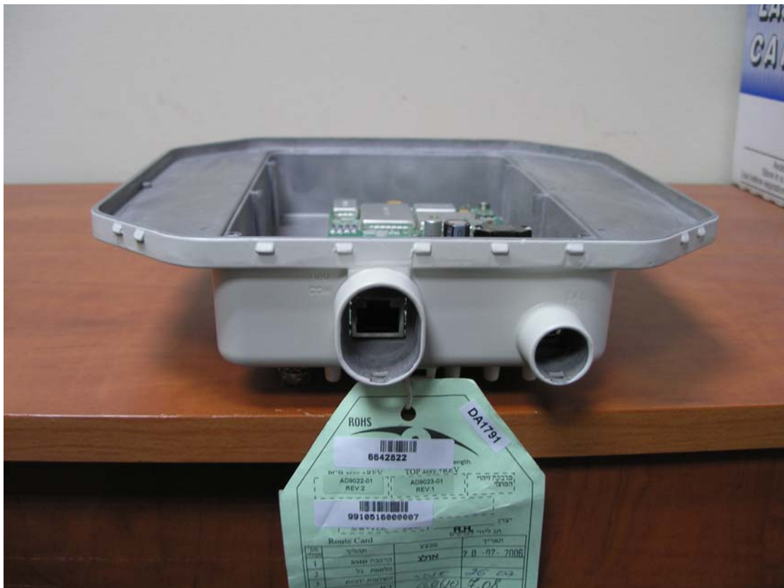
Photo4. Connectors side view