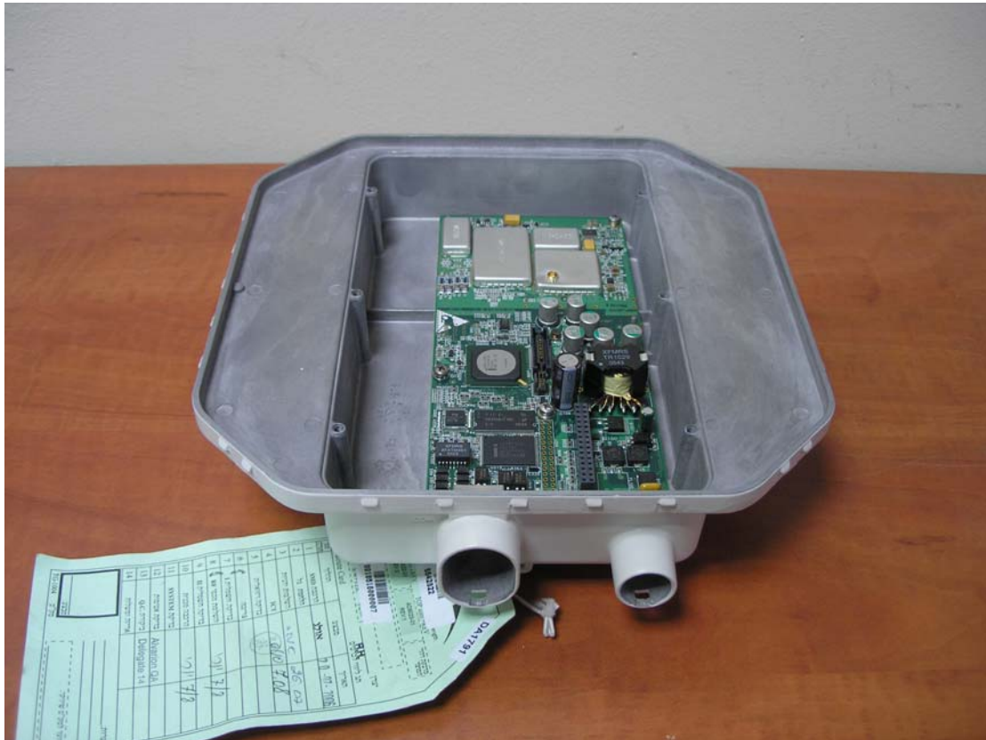
Photo3. PCB view