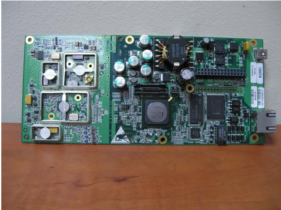
Photo6. PCB components side