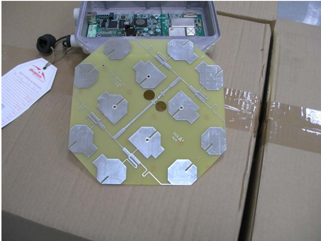
Photo 8. Integral antenna view