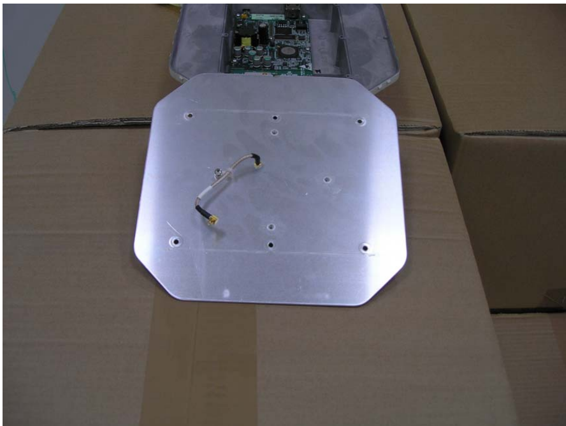
Photo7. metal cover