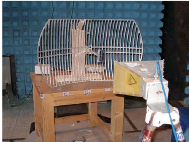
Photo 3. Investigation test at 1m test distance.