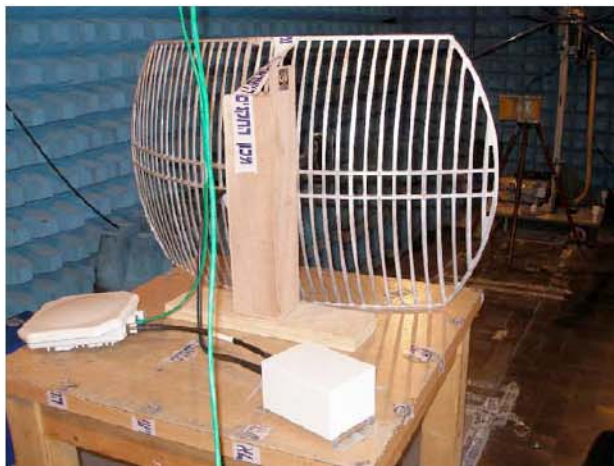
Photo 2. Measurement of radiated emission. Test setup.