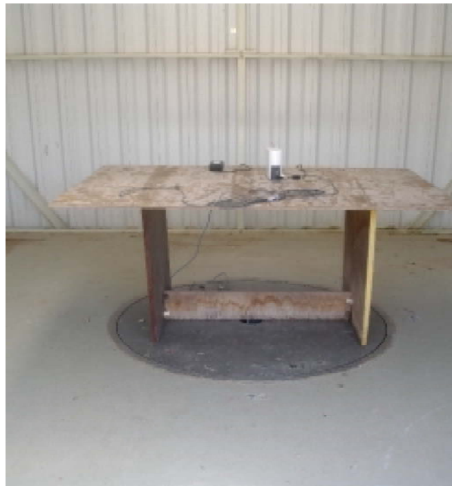
Photo 2. Test setup on OATS.