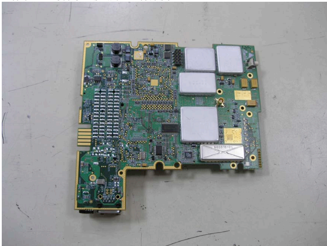
BreezeMAX 2300 CPE Si with RF covers on