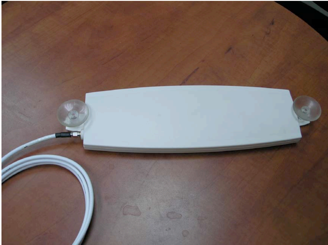
Back side board of integrated antenna