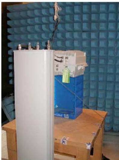
Photo 3. Test setup in anechoic chamber.