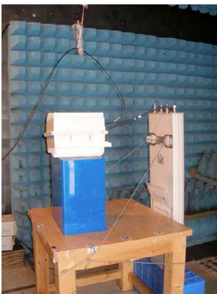
Photo 2. Test setup in anechoic chamber..