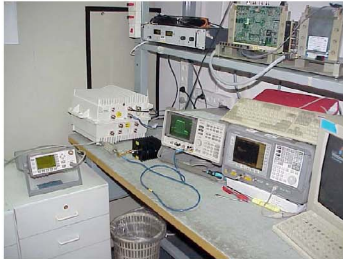
Photo 1. Conducted measurements. Test setup.