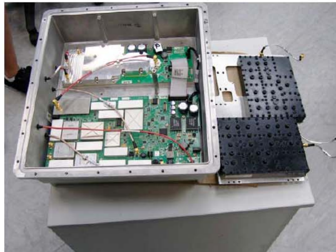
Photo 4. Internal view of outdoor unit.