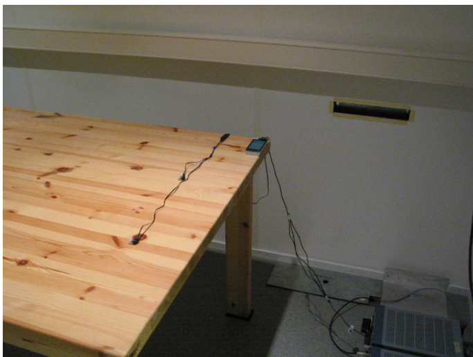
Picture 3 AC powerline conducted emission measurement 15C