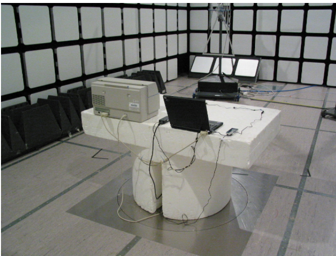
Picture 2 Radiated emission 15B