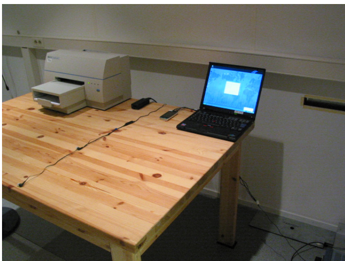
Picture 4 AC powerline conducted emission measurement 15B