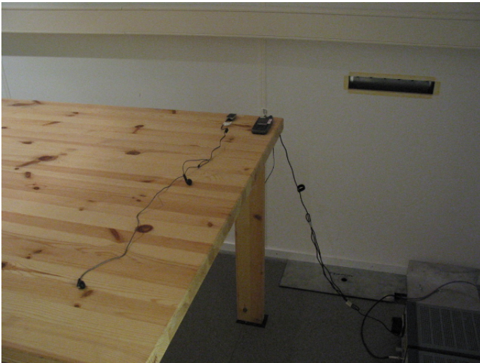
Picture 2 AC powerline conducted emission measurement 15C