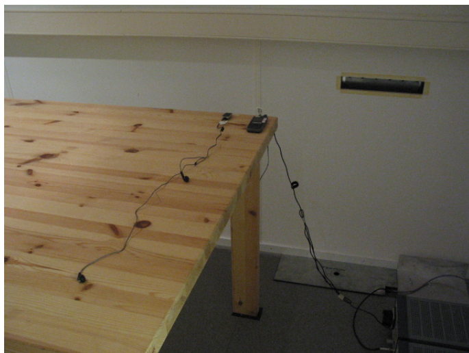
Picture 2 AC powerline conducted emission measurement 15C