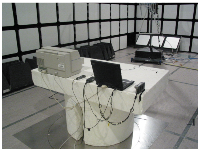
Picture 3 Radiated emission 15B