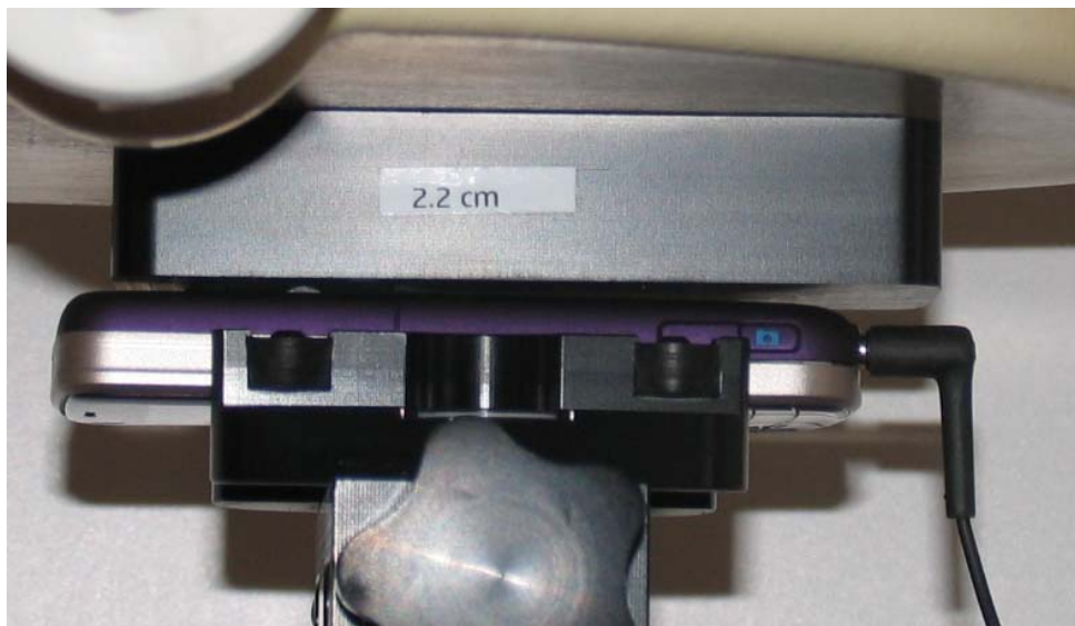
Photo of the device positioned for Body SAR measurement. The spacer was removed for the tests.

The device was placed in the SPEAG holder using the Nokia spacer and placed below the flat section of the phantom. The distance between the device and the phantom was kept at the separation distance indicated in the photo below using a separate flat spacer that was removed before the start of the measurements. The device was oriented with its antenna facing the phantom since this orientation gives higher results.