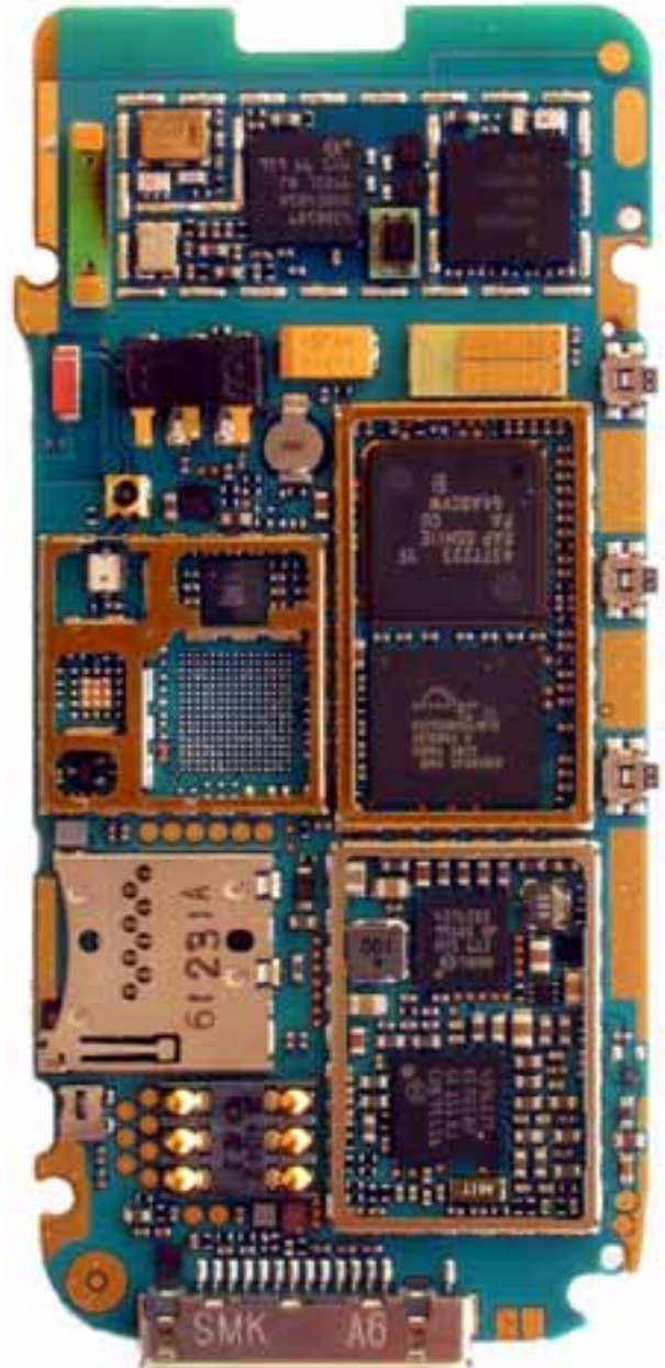
Internal Photographs Exhibit 9 Applicant: Nokia Corporation