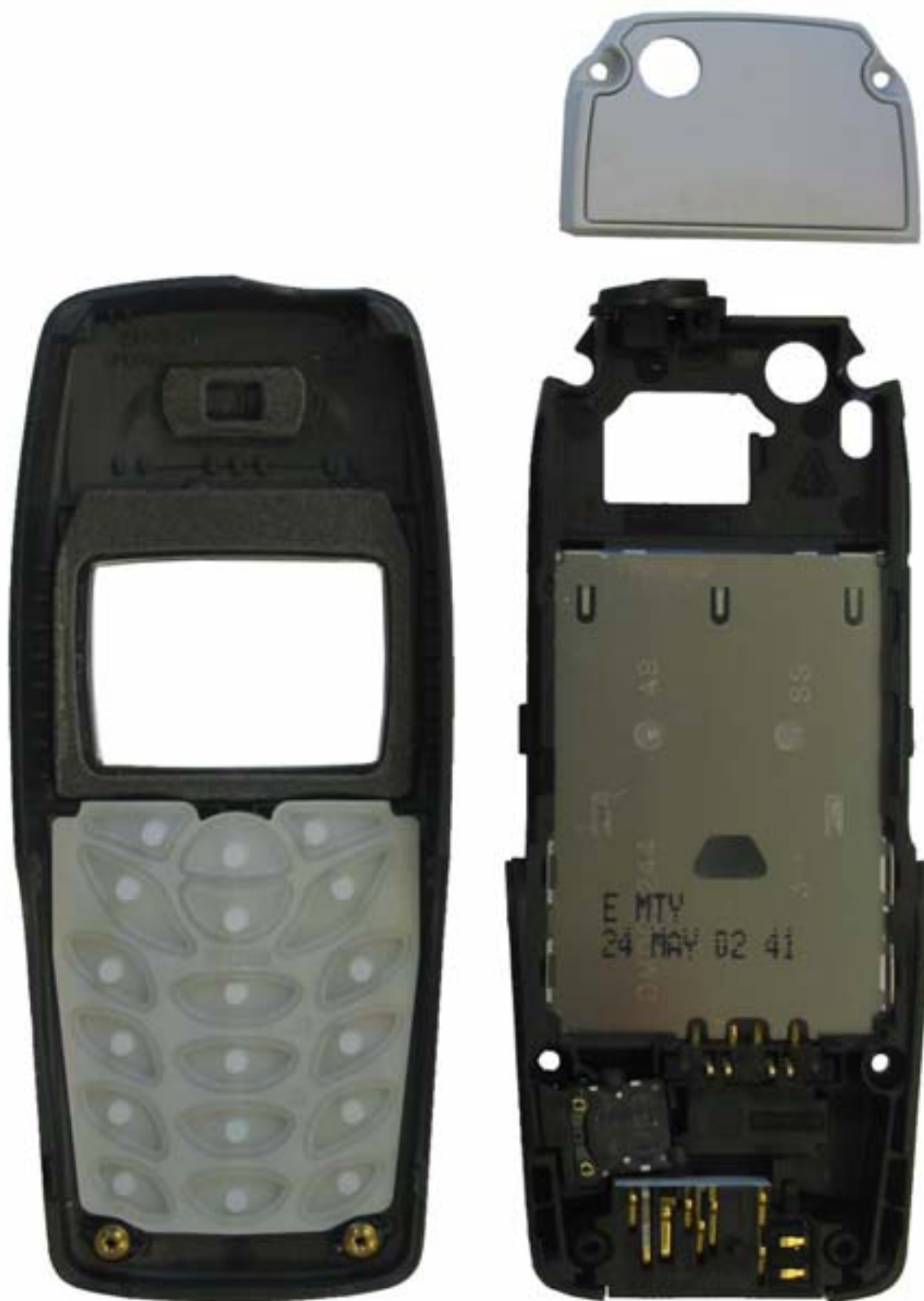
Exhibit 9: Internal Photographs