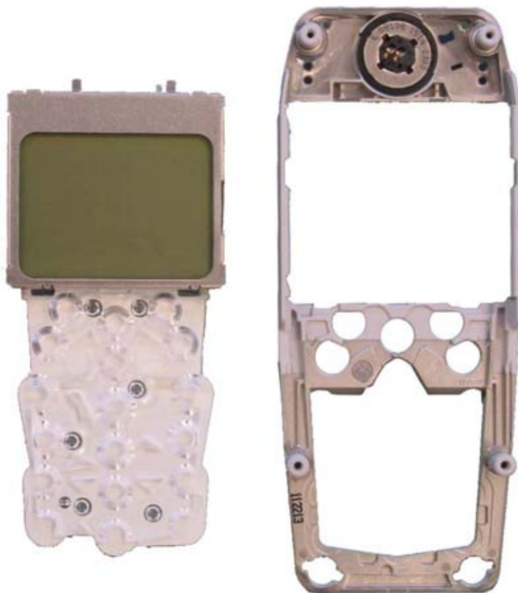
Exhibit 9: Internal Photographs