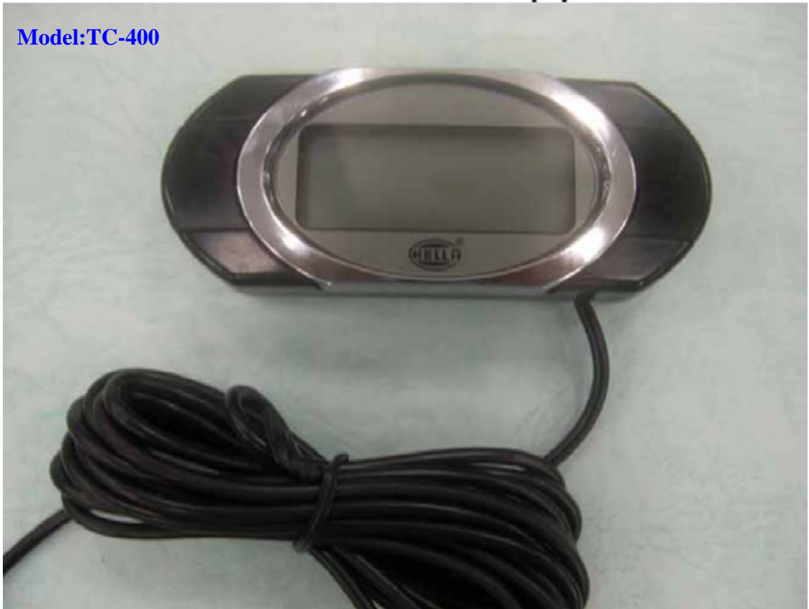
Original sensor design