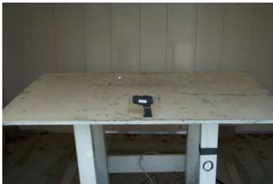
Figure 3.2 Radiated Test Setup, Position 2