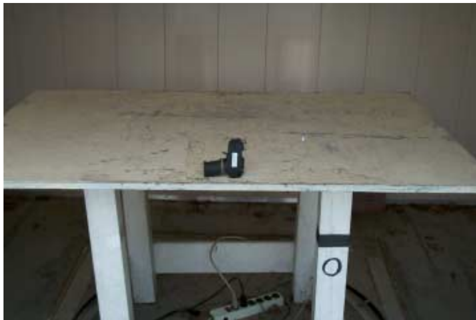
Figure 3.3 Radiated Test Setup, Position 3