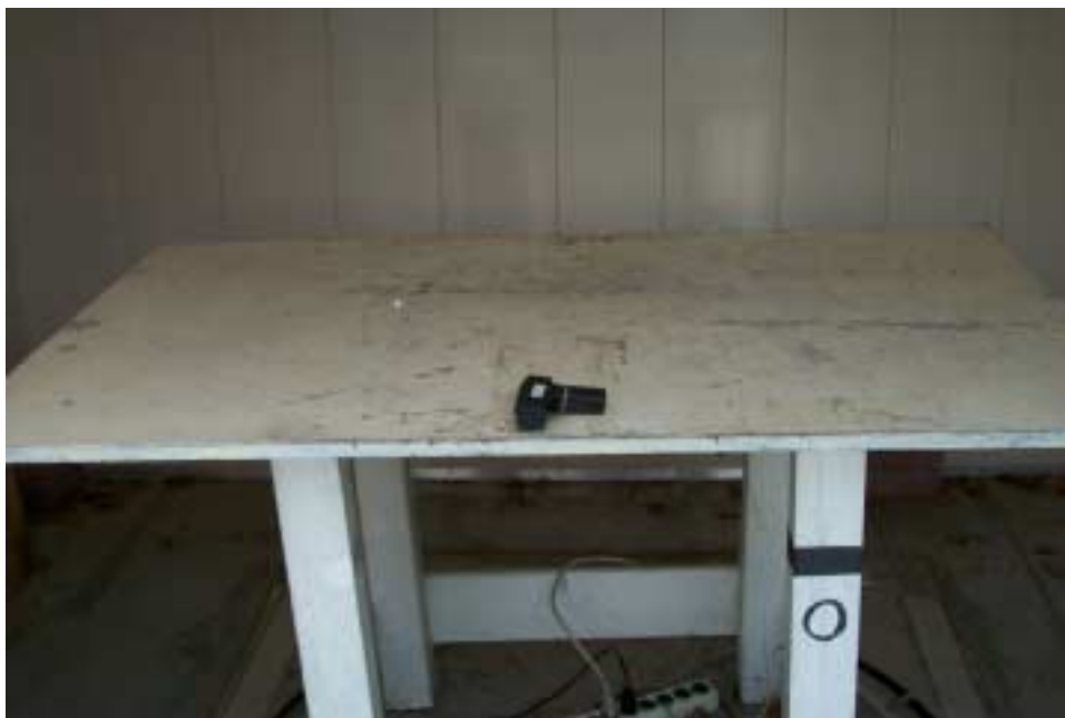
Figure 3.1 Radiated Test Setup, Position 1