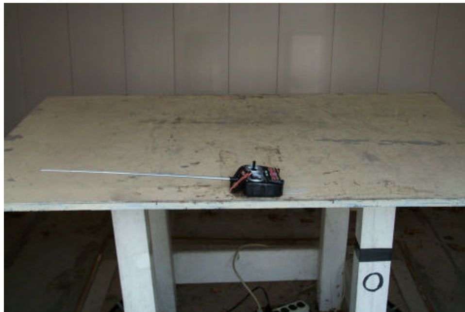
Figure 3.3 Radiated Test Setup, Position 3