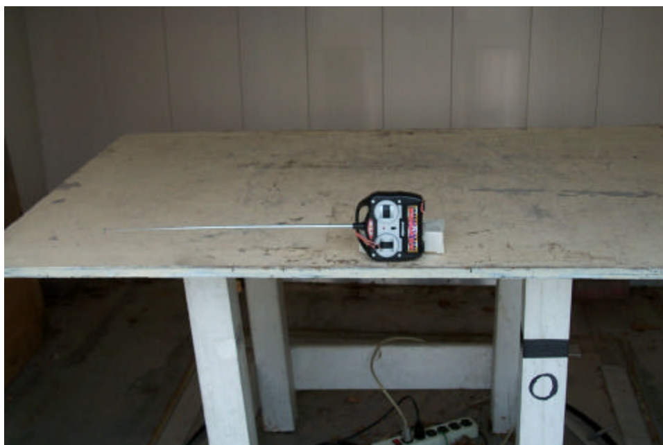
Figure 3.2 Radiated Test Setup, Position 2