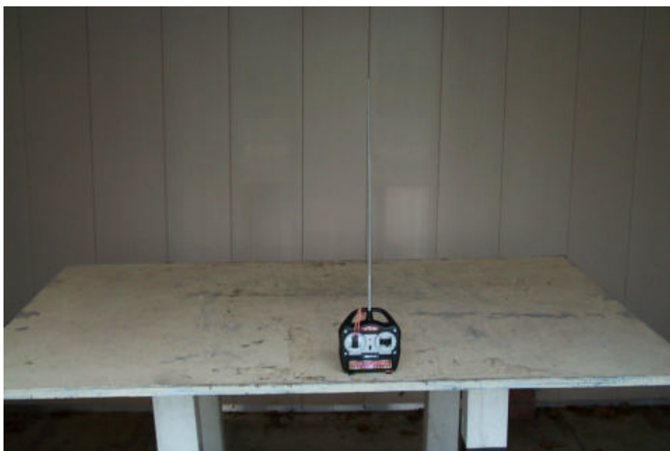
Figure 3.1 Radiated Test Setup, Position 1