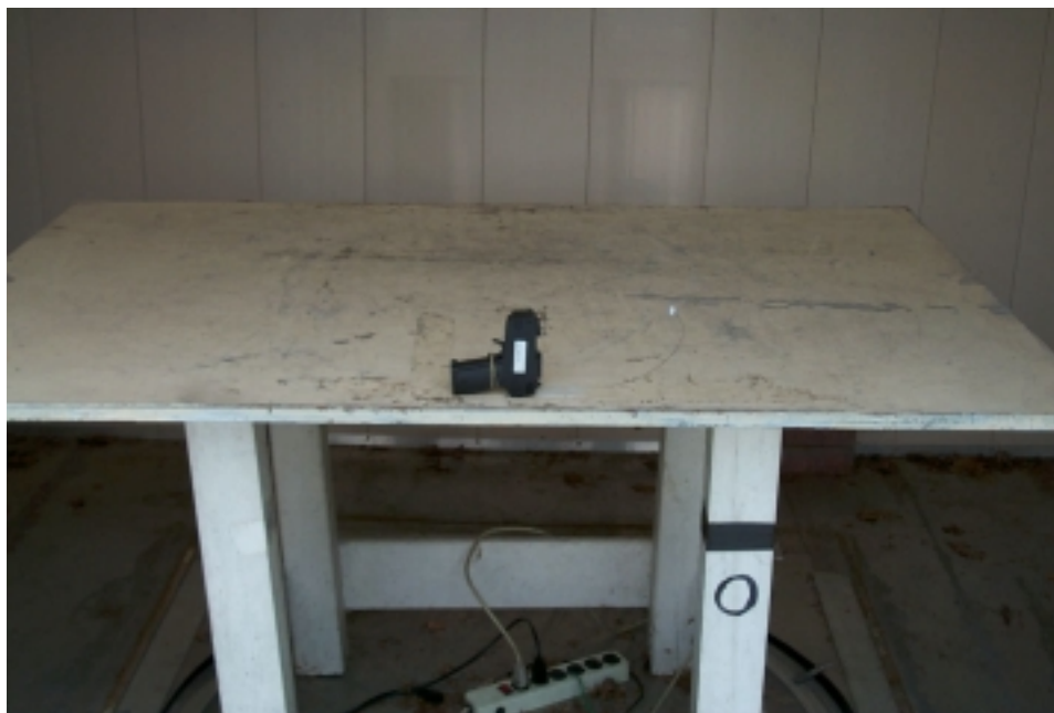
Figure 3.3 Radiated Test Setup, Position 3