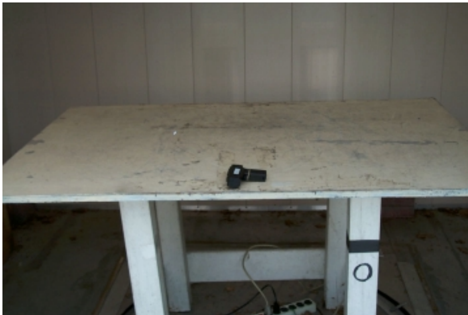
Figure 3.1 Radiated Test Setup, Position 1