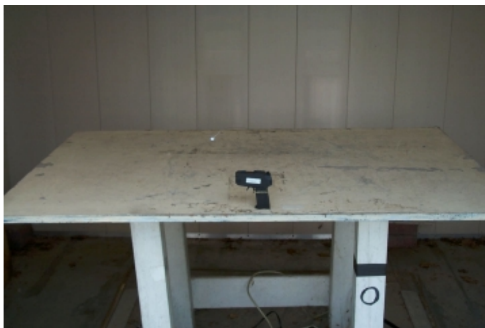
Figure 3.2 Radiated Test Setup, Position 2